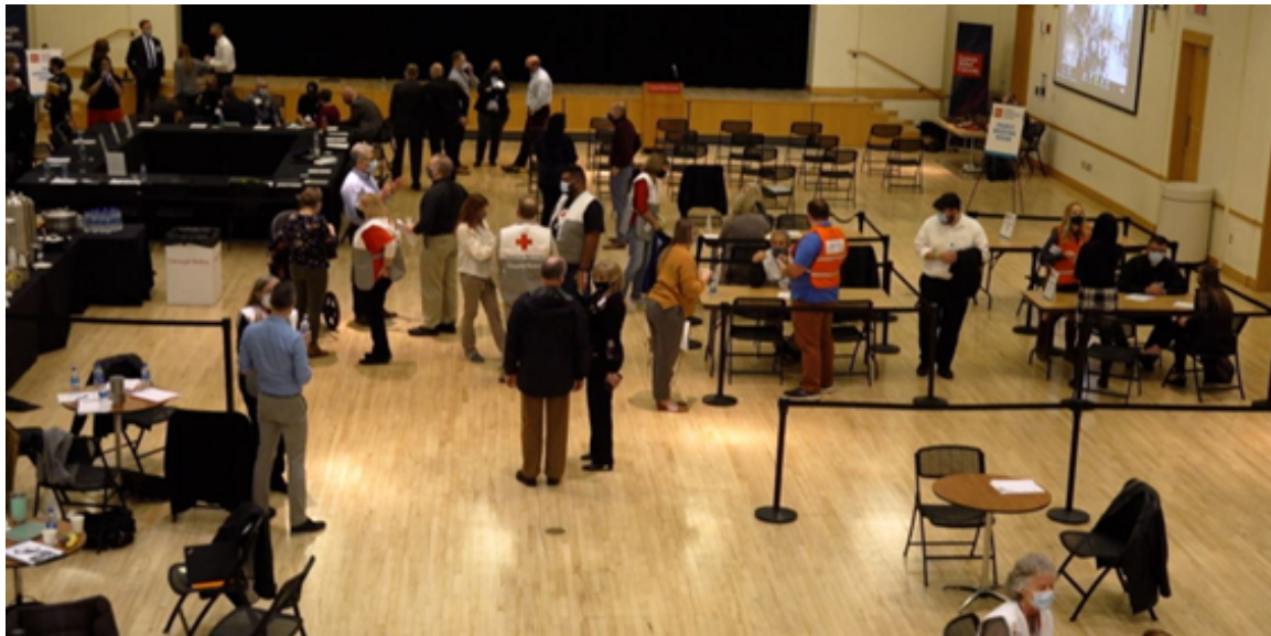
Mock Family Assistance Center in Rangos Ballroom

The exercise was a huge success. The entire Enterprise Risk Management and Division of Operations leadership team are grateful to all who were involved in the drill, which helps to ensure the preparedness of our campus. ♦