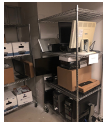
Secure area in Hamerschlag Hall with accepted items.

For more information, or to schedule a waste pick up, visit the EHS Electronic Waste webpage. ◆