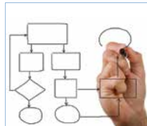
Roger establishes a plan of action with Ellen to determine the direction and resources needed and to help prioritize those resources.