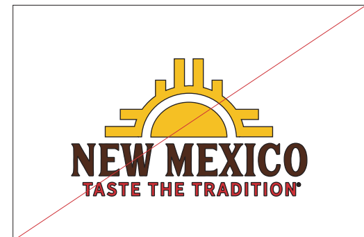
DO NOT add strokes or outlines around the logo