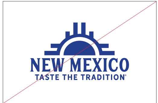
DO NOT change colors or use unauthorized colors