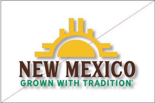
DO NOT apply drop shadows or outer glows