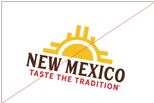
DO NOT rotate or tilt