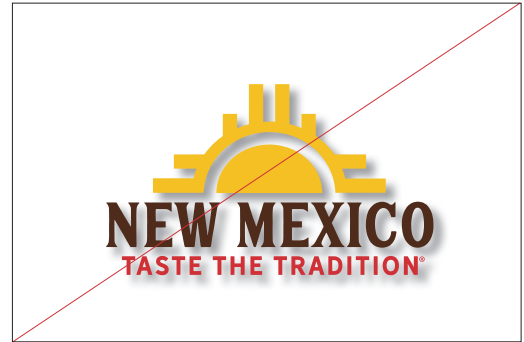
DO NOT apply drop shadows or outer glows