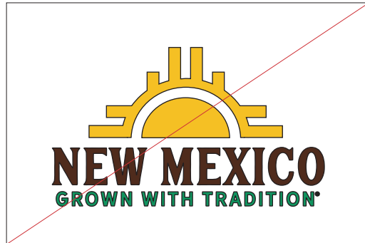
DO NOT add strokes or outlines around the logo