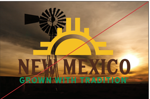
DO NOT use logo on a busy background