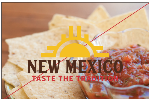
DO NOT use logo on a busy background