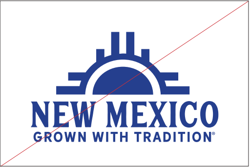
DO NOT change colors or use unauthorized colors