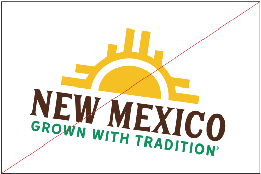
DO NOT rotate or tilt