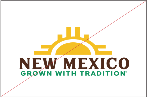
DO NOT stretch, distort or alter

Keeping traditions sometimes means avoiding adding incorrect ingredients or methods to recipes. To maintain consistency, please avoid the common incorrect usages below: