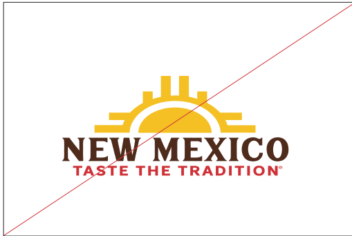
DO NOT stretch, distort or alter

Keeping traditions sometimes means avoiding adding incorrect ingredients or methods to recipes. To maintain consistency, please avoid the common incorrect usages below: