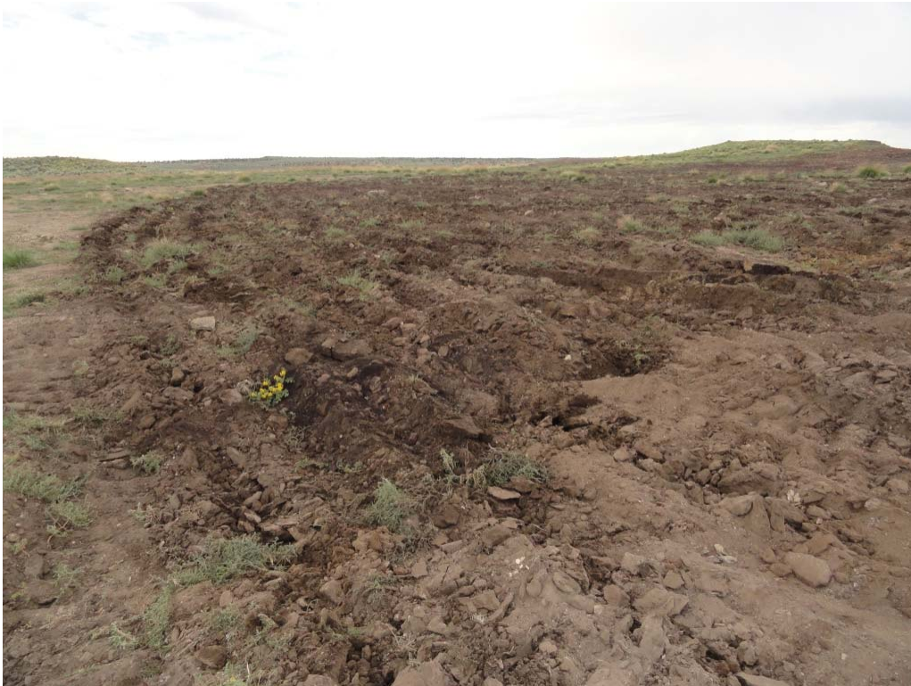
Deeply ripped mine reclamation in sandy, poorly developed soils

In high desert environments with low precipitation and poor soil conditions, such as in portions of McKinley County where humate mining is abundant, MMD has encouraged operators to employ low cost land reclamation techniques in an attempt to maximize reclamation success. One of the methods employed recently in McKinley County that has shown some success is deep-ripping. Ripping breaks apart the compacted layers after backfilling, which is especially important when the surface has become crusted and difficult to penetrate. Ripping is performed along the contour of any slopes and is performed to a depth of between 2-3 feet. Reseeding is performed immediately after ripping.