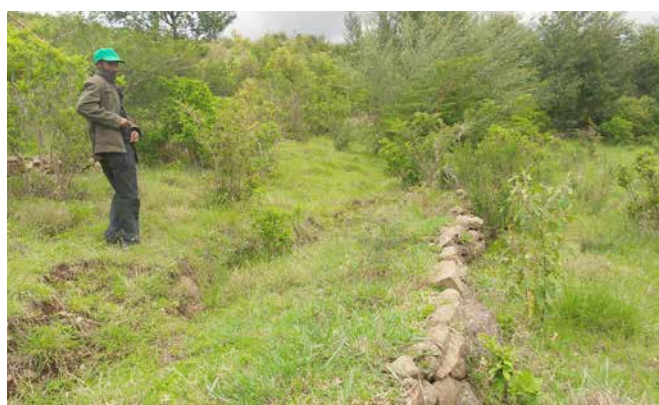
Rehabilitated catchment using excavated trench, stone bunding and grass reseeding at Miriam Monze watershed, Amhara Region

but could have been used by all projects with on-the-ground interventions to facilitate wider assessment and documentation of SLM technologies and approaches by local actors for their wider diffusion.