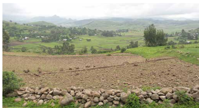
Stone bunding for soil conservation on cultivated lands in at Miriam Monze watershed, Amhara Region