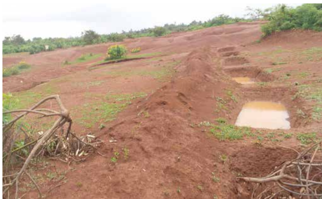
Soil and water conservation interventions at Mecha Amarit