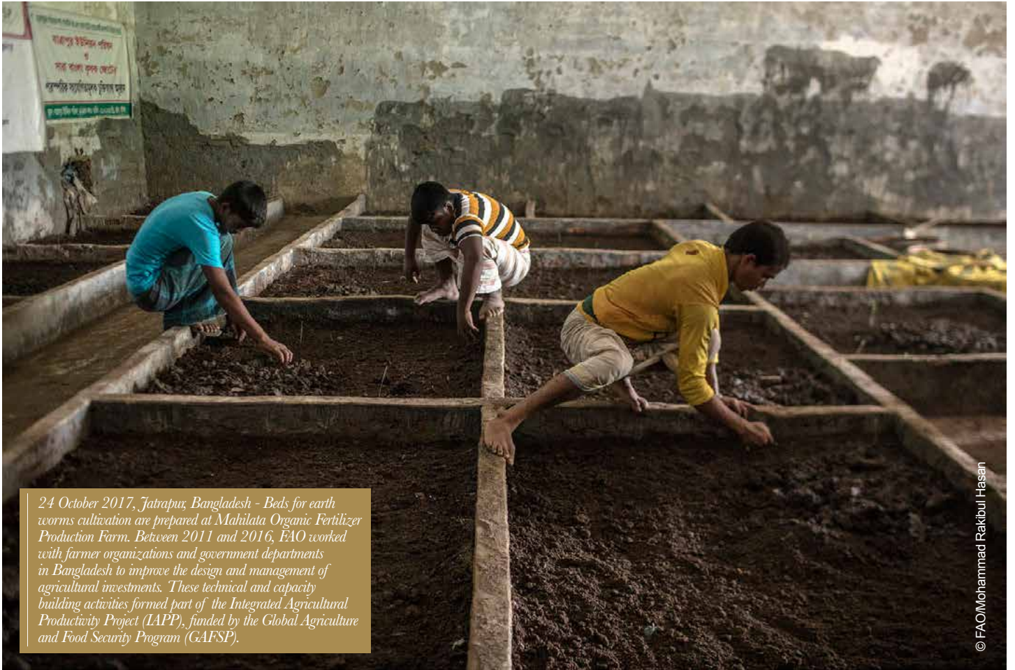
24 October 2017, Jatroapur, Bangladesh - Beds for earth worms cultivation are prepared at Mahilata Organic Fertilizer Production Farm. Between 2011 and 2016, FAO worked with farmer organizations and government departments in Bangladesh to improve the design and management of agricultural investments. These technical and capacity building activities formed part of the Integrated Agricultural Productivity Project (IAPP), funded by the Global Agriculture and Food Security Program (GAFSP).