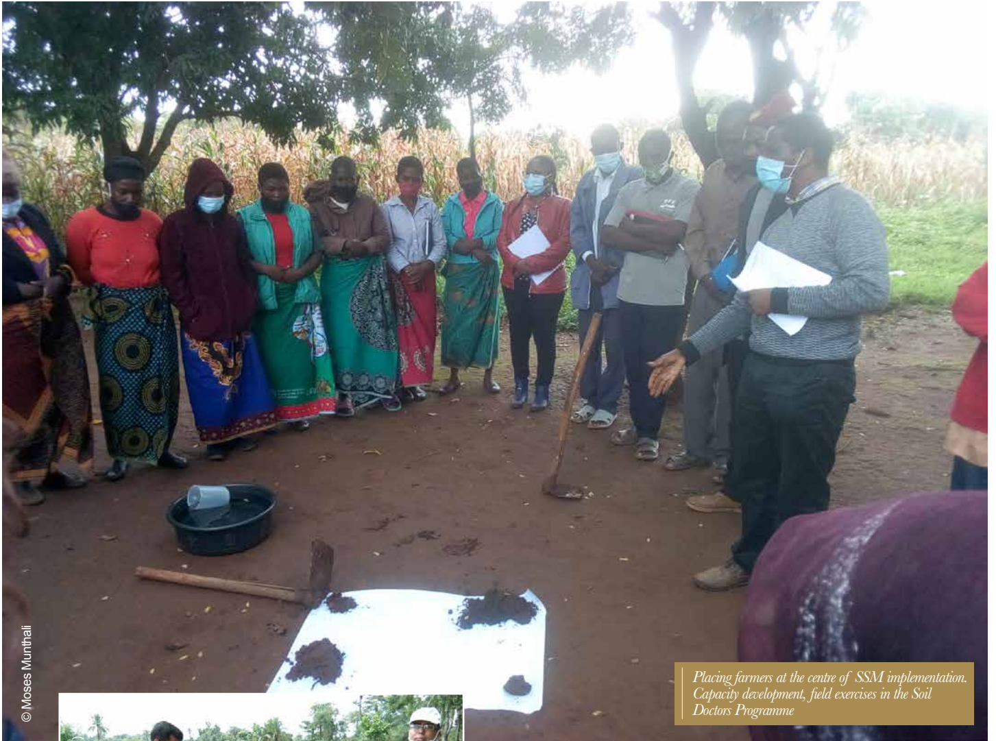
Placing farmers at the centre of SSM implementation. Capacity development, field exercises in the Soil Doctors Programme