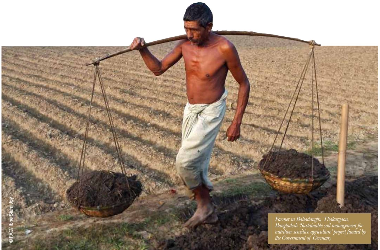
Farmer in Baliadanghi, Thakurgaon, Bangladesh. 'Sustainable soil management for nutrition-sensitive agriculture' project funded by the Government of Germany

micro-, meso-, mega-, and macro-fauna. The interaction of soil properties, either physical, chemical or biological makes it possible for soils to produce, store, supply, and transfer the essential macro- and micro-nutrients to plants (Weil and Brady, 2017). Management and the interaction with environmentally non-controlled conditions can strongly influence soil properties.