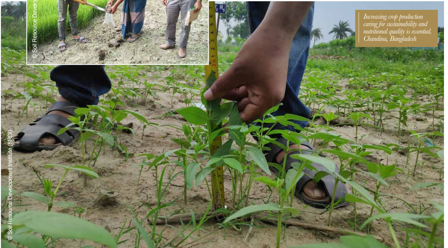
Increasing crop production caring for sustainability and nutritional quality is essential. Chandina, Bangladesh