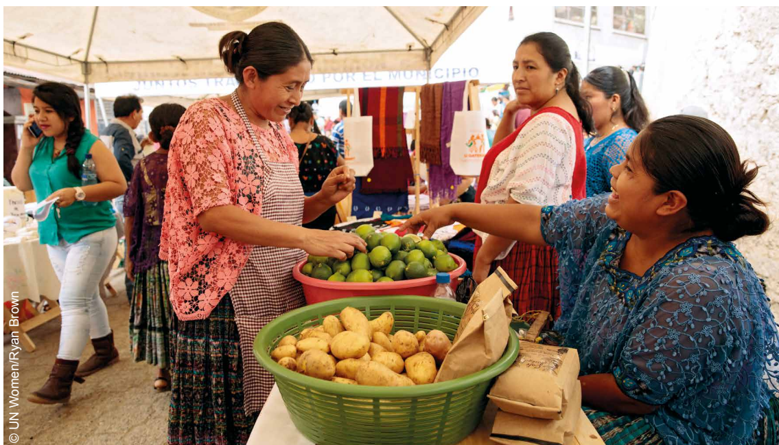
Women selling their produce in a municipal market in Tucuru, central Guatemala.

Despite that maternal mortality has nearly halved, from 205 maternal deaths per 100 000 live births in 1990, to 95 per 100 000 in 2017, it is still one of the highest in the region (World Bank, 2022b). Gender-based violence and femicide remain a major issue and Guatemala ranks among the countries with the highest rate of violent deaths among women (9.7 of 100 000) (UN Women, 2022). Women and girls aged 15 + also spend 20.6 percent of their time on unpaid care and domestic work, compared to 2.1 percent spent by men (UN Women, 2022). Regarding political representation, only 19 percent of seats in the national parliament were held by women in 2021 (World Bank, 2022c).