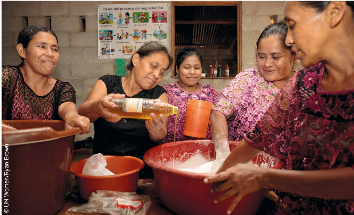
Women from Aldea Campur, in Alta Verapaz, have learned to produce and sell shampoo in local markets thanks to the support from the Joint Programme on Accelerating Progress Towards the Economic Empowerment of Rural Women (JP RWEE) .

In Guatemala, the programme focused on an area where the needs are high. The Valley of Polochic, represents one of the poorest regions in Guatemala and is a critical area for working on gender equality and women's rights. The municipalities in which the JP RWEE focused are 89 percent indigenous, and the poverty rate is significantly higher than the national average – at the time of the programme design, the poverty rate was 85 percent in the Valley of Polochic, compared to the national average rate of 59.3 percent, and the relative economic participation of women is lower than the national average (JP RWEE, 2021a).