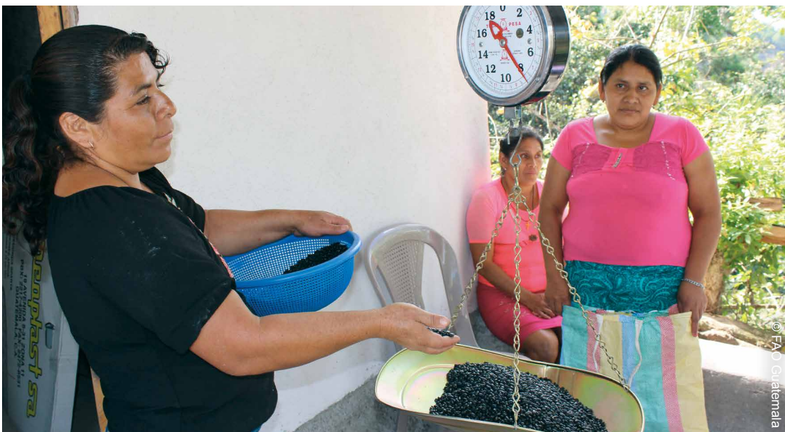
Women weigh basic grains in the Guatemalan Dry Corridor. FAO supported with agricultural inputs (seeds) and technical assistance about storing the grains for periods of shortage. The activity is part of the project Restoring food system and strengthening resilience of families affected by drought 2014 in Chiquimula and Jalapa, Guatemala.

To facilitate attendance of women with young children at training sessions, the project introduced “mobile childcare” – trainees would take turns looking after kids so the other women could pay full attention (FAO, 2015b). It proved very cost-effective, requiring only a sufficient number of toys. The project staff also reported that during technical training involving both women and men, they had successfully fostered “positive masculinities” that allowed men the opportunity to appreciate women’s participation as equals.