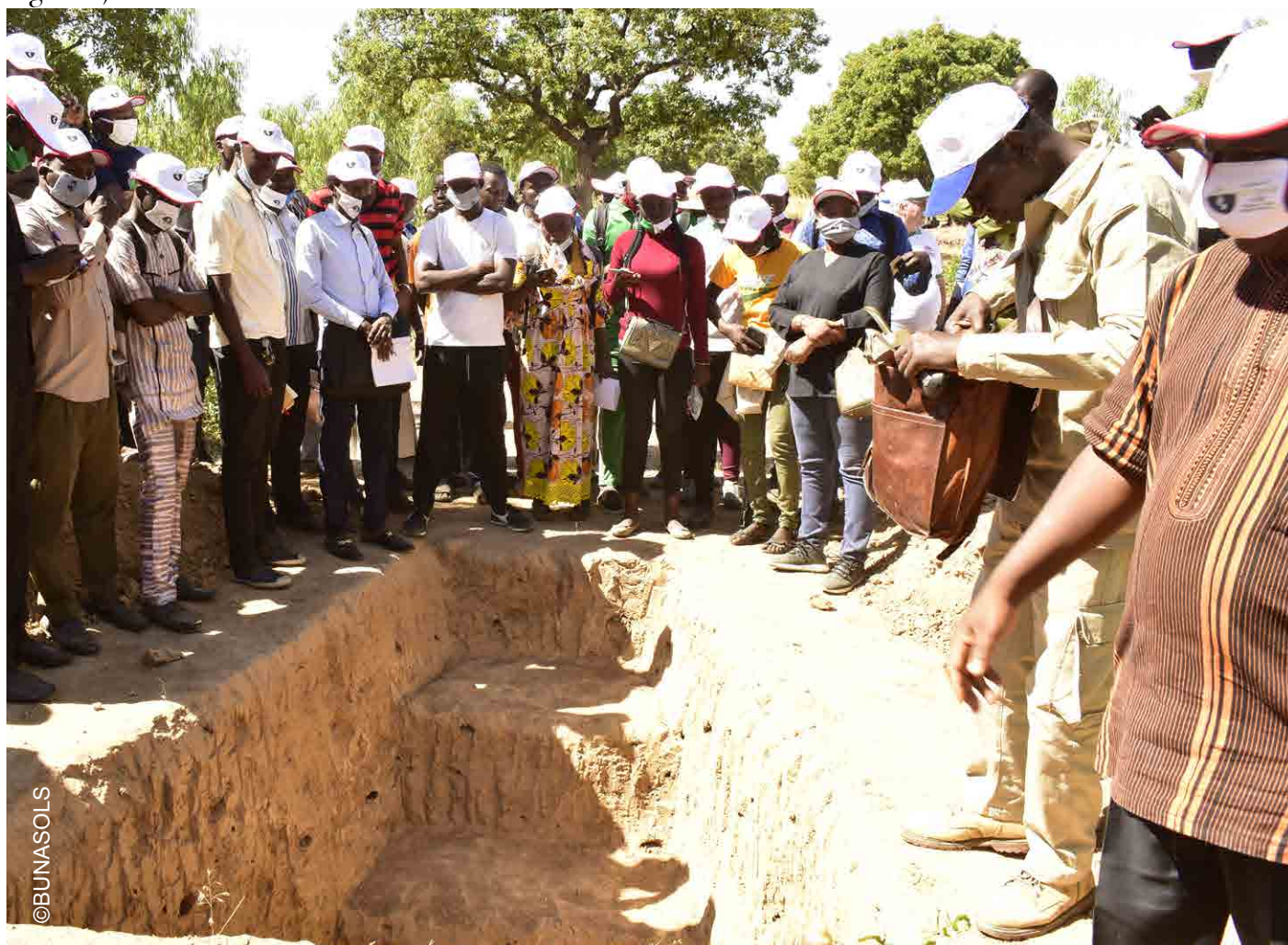
Figure 2. Training of MARAH agents from the North-Centre region of Burkina Faso

With the support of the German Ministry of Food and Agriculture, the Government of Burkina Faso (through BUNASOLS) and FAO's GSP have made a major effort in highlighting the critical role of SSM in nutrition through the Soils4Nutrition project, implemented in Burkina Faso, Malawi and Bangladesh. Using the Voluntary Guidelines for Sustainable Soil Management (FAO, 2017) and the International Code of Conduct for the Sustainable Use and Management of Fertilizers (FAO, 2019) as a basis, this initiative took stock of the existing scientific knowledge in the country and made strong and operational recommendations for SSM in Burkina Faso.