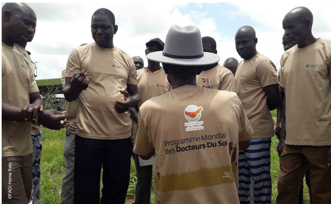
Figure 3. The Soil Doctors programme in the field

and in providing knowledge of the local context, while FAO provides relevant educational materials. In line with the project's objective of promoting the adoption of SSM linked to improved nutrition, this first pilot proved to be very effective, training 20 trainers and selecting 45 farmers as "Soil Doctors" to explain and disseminate knowledge on SSM and soil health to the final beneficiaries (Figure 3).