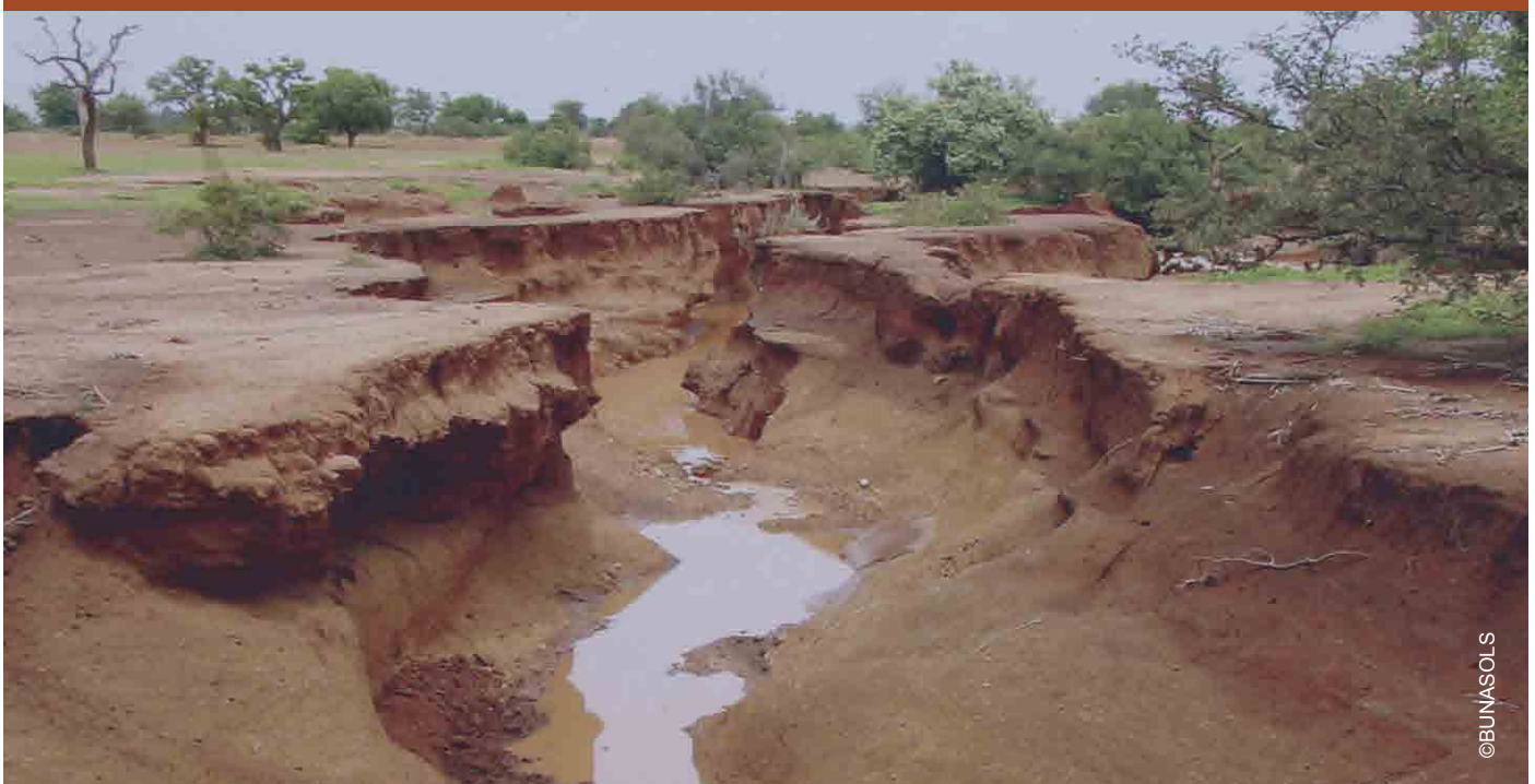
Figure 1. Heavy water erosion in the minor bed of a river