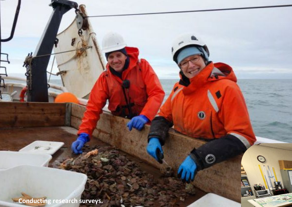
Conducting research surveys.