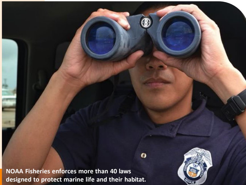
NOAA Fisheries enforces more than 40 laws designed to protect marine life and their habitat.