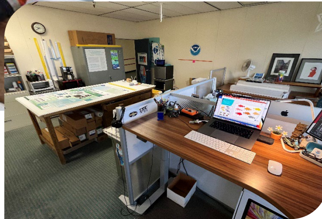
From graphic designers to IT specialists, NOAA Fisheries relies on the talents of many different experts.