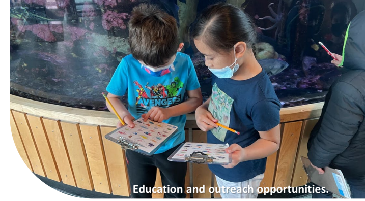
Education and outreach opportunities.