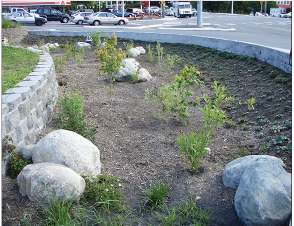
Figure 3: Rain Garden in King County, Washington