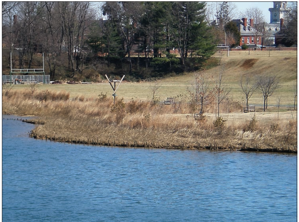
Figure 4: A Living Shoreline, Annapolis, Maryland