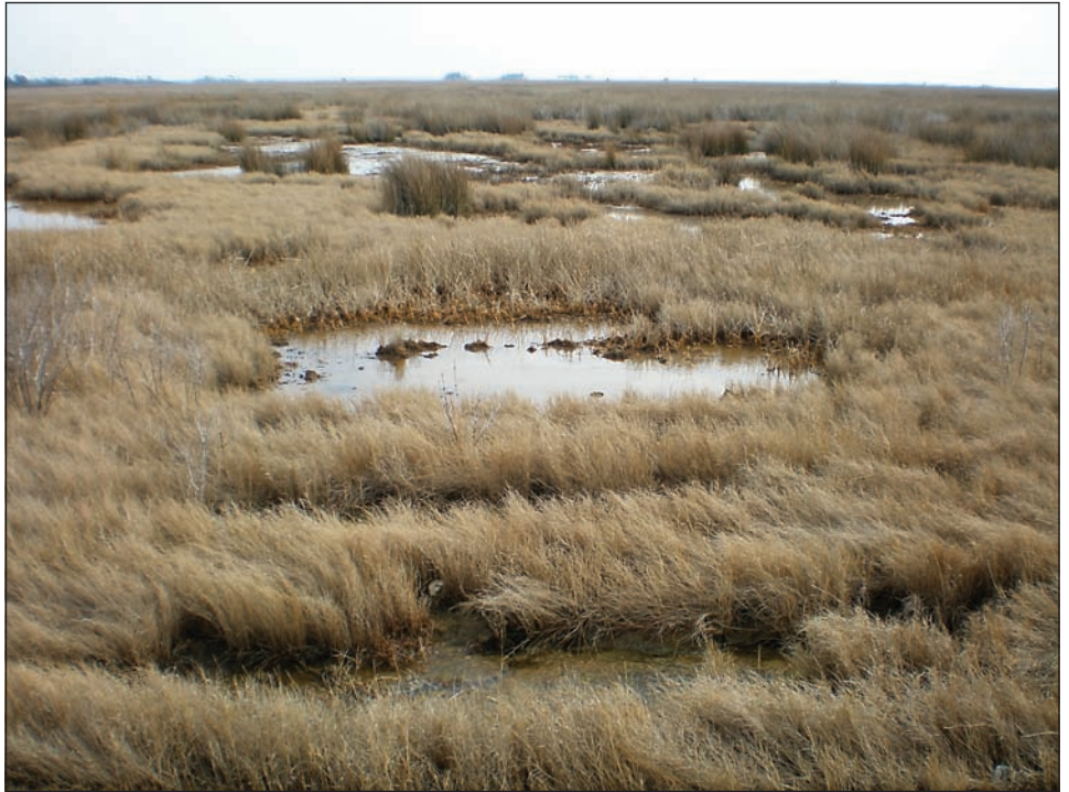
Figure 5: Salt Marsh in Somerset County, Maryland