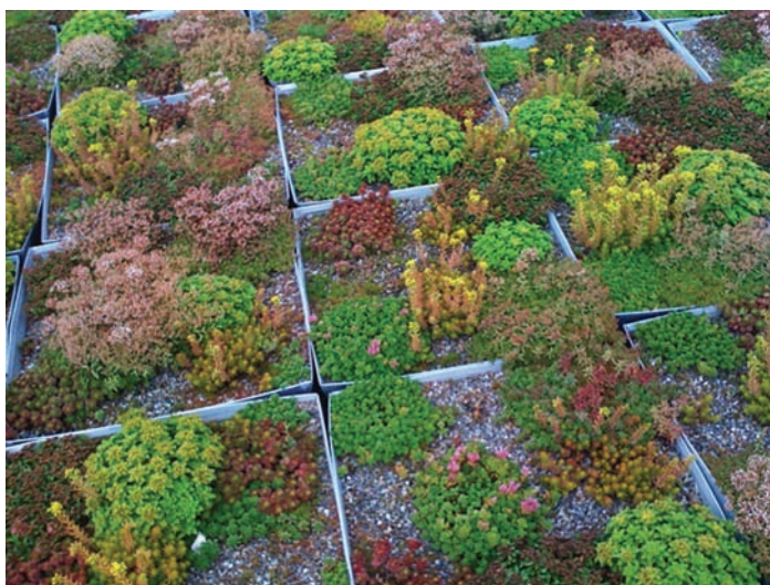
Figure 2: New York City Department of Parks and Recreation Green Roofs at Five Borough Technical Services Facility