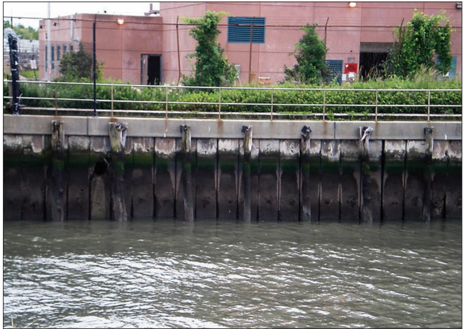
Figure 1: Tallman Island Water Pollution Control Plant, Queens, New York City