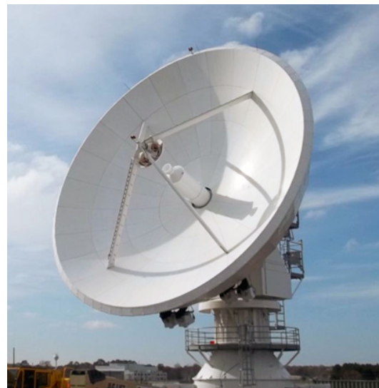
W-1 antenna at WCDAS

NOAA upgraded four 9.1 meter antennas at NSOF for compatibility with the GOES-R satellites and constructed three new 16.4 meter antennas at WCDAS and three new 16.4 meter antennas at CBU. The new and upgraded antennas maintain compatibility with the previous generation of GOES satellites, some of which remain on orbit as backup for NOAA's operational constellation. The antennas will operate continuously for the life of the GOES-R Series.