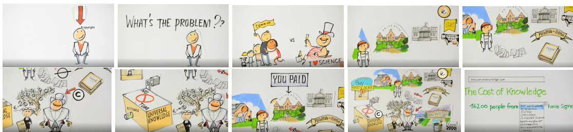
Figure A2: Video frames of the T_Activist Video

But, let's get back to data mining as a scientific publishers own the copyright to most of the knowledge contained in these Published before works, they consider how much access people get over their content. Including if you want to mine it, once you've paid for it. If you just want to read it with your eyes that's probably fine, but if you want to mine the data in this thing then, oh! well... Maybe we'll tell you which tools you can use, and it might cost you more to mine it than it would to read it, and that we might restrict how many pages that you can actually use algorithms on per-day. And maybe you can only read the text, and you can't look at the images and the charts. Honestly, complete control freaks! Now the EU copyright review urgently needs to curb this business of copyright that is smothering science. Copyright is a tool, not a goal! The goal is human knowledge and better access to this knowledge for everyone. In our next video, we'll talk about artists, industry, and copyright. The good, the bad, and the ugly. So subscribed, and don't miss out on the fun, and goodbye."