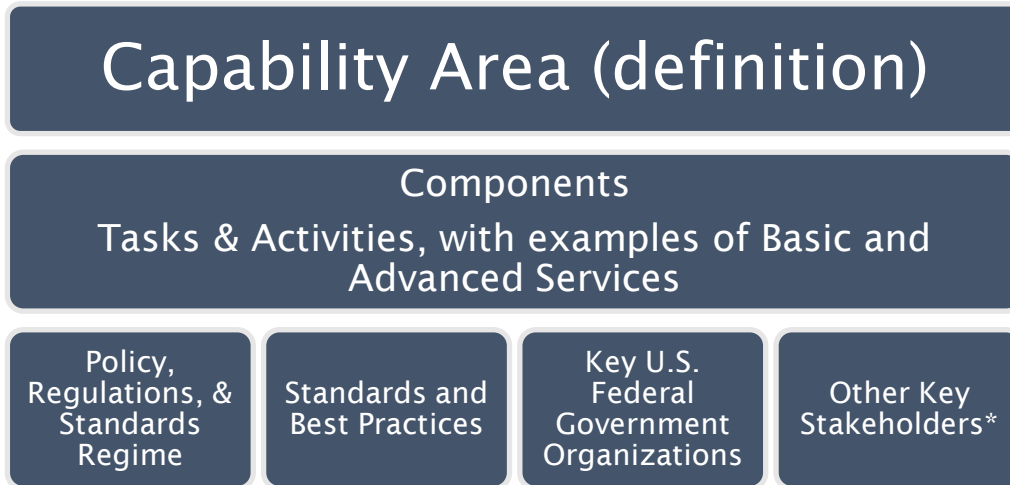
Figure 3-1. Organization of the Capabilities

*U.S. government and military, commercial actors, academia and research, international actors