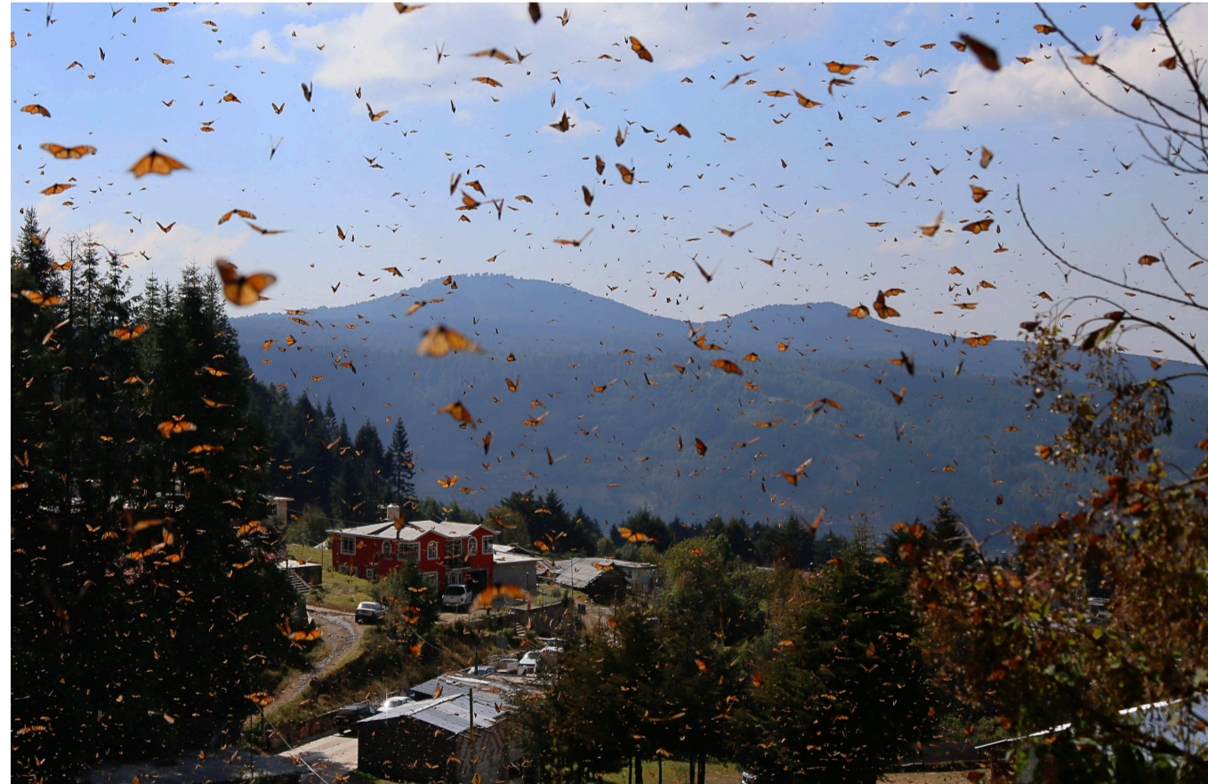
FLUTTER SPEED MEETS SHUTTER SPEED Monarch butterflies fill the air around on the mountaintops in the Monarch Butterfly Biosphere Reserve, a UNESCO World Heritage Site in Michoacán, Mexico.

The migratory monarch butterfly, a subspecies of the monarch butterfly, was recently added to the IUCN's Red List as an endangered species, due to pressures from habitat loss and climate change.