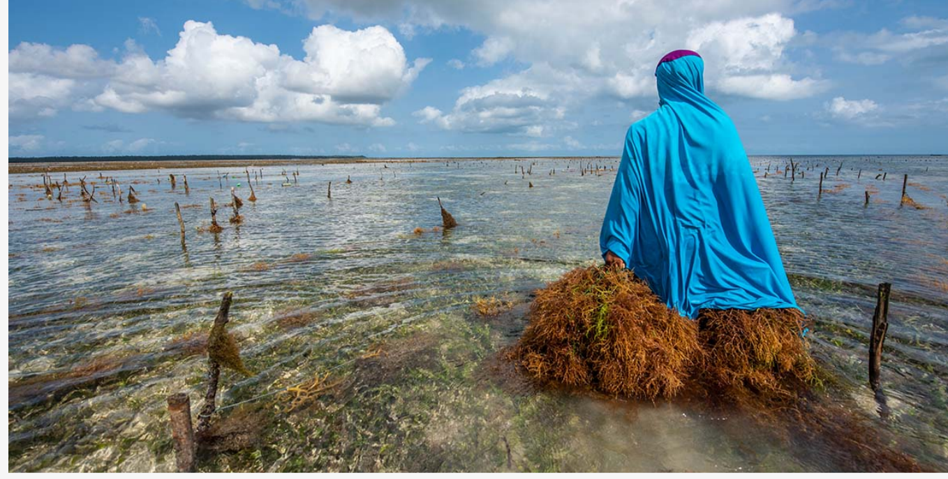
© Siti Ali Saidi is a seaweed farmer in Tumbé, Zanzibar / © Roshni Lodhia