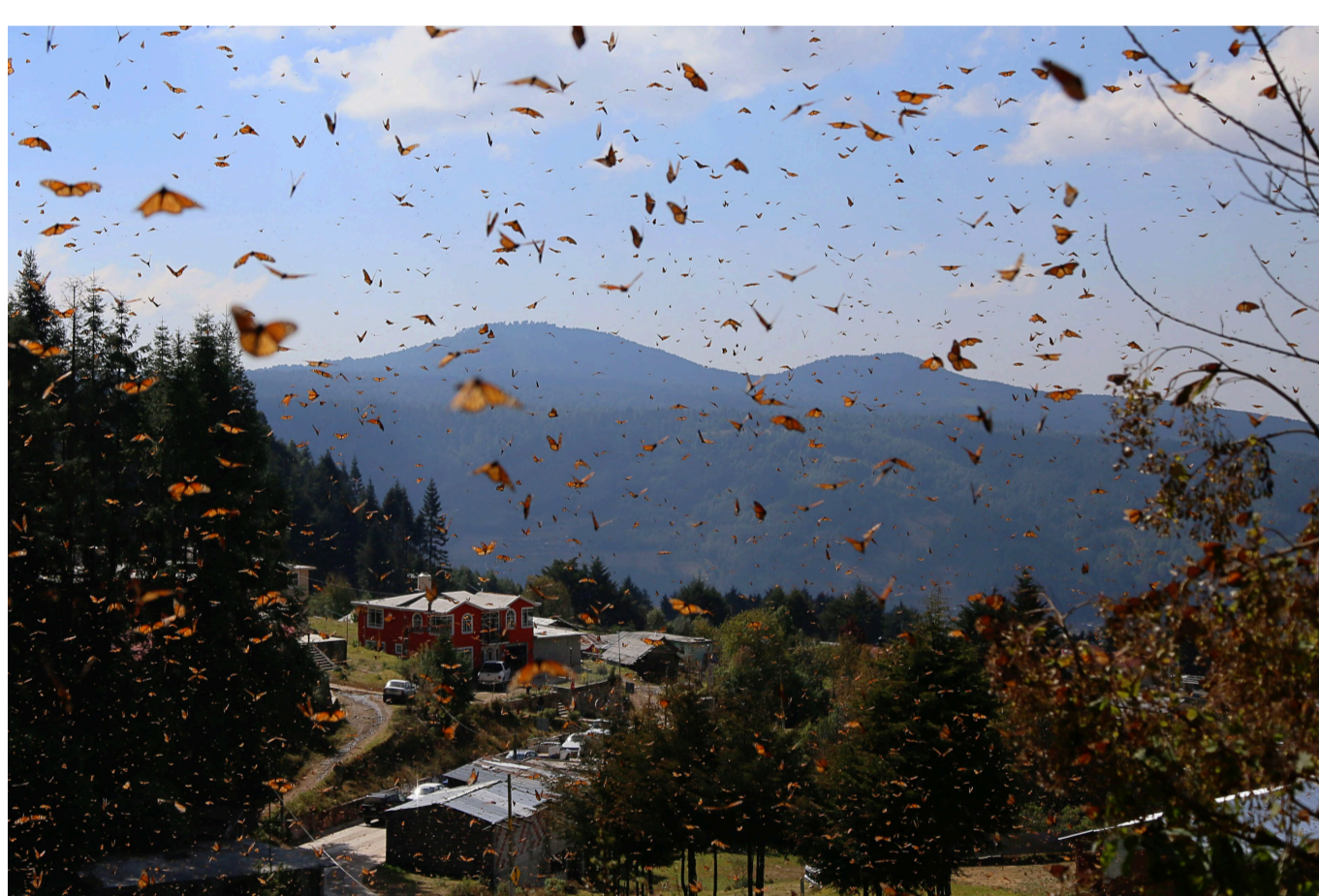
FLUTTER SPEED MEETS SHUTTER SPEED Monarch butterflies fill the air around on the mountaintops in the Monarch Butterfly Biosphere Reserve, a UNESCO World Heritage Site in Michoacán, Mexico.

The migratory monarch butterfly, a subspecies of the monarch butterfly, was recently added to the IUCN's Red List as an endangered species, due to pressures from habitat loss and climate change.