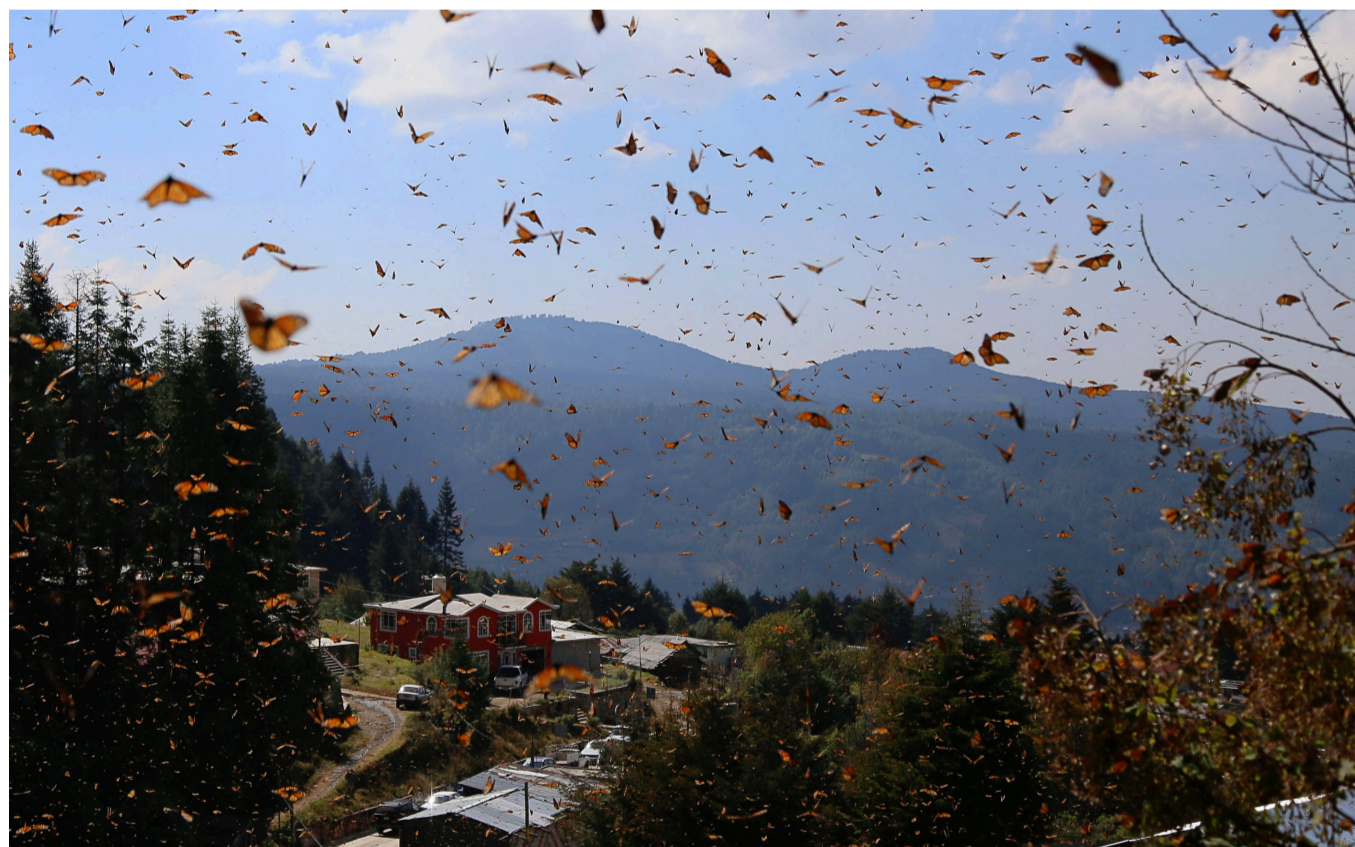
FLUTTER SPEED MEETS SHUTTER SPEED Monarch butterflies fill the air around the mountaintops in the Monarch Butterfly Biosphere Reserve, a UNESCO World Heritage Site in Michoacán, Mexico.

The migratory monarch butterfly, a subspecies of the monarch butterfly, was recently added to the IUCN's Red List as an endangered species, due to pressures from habitat loss and climate change.