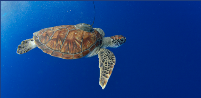
An Argos tracker attached to a sea turtle.

In 2024, CNES and its subsidiary companies, Collecte Localisation Satellites (CLS) and Kinéis, plan to launch 25 small-sats, enhancing the Argos program and significantly improving marine animal tracking capabilities.