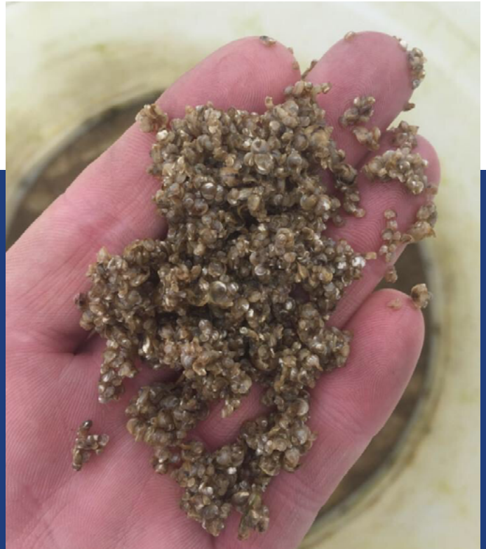
A handful of young oyster spat ready to be stocked in underwater cages at an aquaculture facility.

Without healthy oceans, we would not have sustainable fisheries and aquaculture—which provide a large supply of seafood. NESDIS collects data on sea surface temperatures, ocean currents, and plankton distribu-