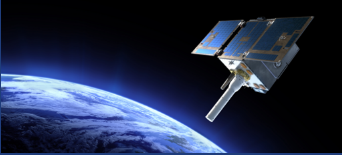
NOAA's latest Argos DCS contribution was launched on Oct. 7, 2022: an Argos-4 payload provided by the French Space Agency (CNES) is hosted onboard the General Atomics' GAZelle satellite.

Innovation in satellite and instrument technology is providing new and improved means of tracking crucial environmental conditions and marine ecosystems. The only satellite capable of tracking very small surface transmitters on Earth is the Argos Data Collection System, which monitors and studies marine species. In a partnership with France's Space Agency, Centre National D'Etudes Spatiales (CNES), dating to the 1970's, NOAA/NESDIS currently contributes four of the nine active polar-orbiting satellites with Argos instruments onboard.