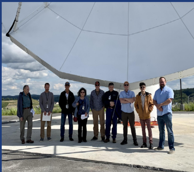
The SWFO team in front of the Consolidated Backup (CBU) Antenna after conducting Antenna Site Acceptance Testing (SAT).

The 2024 launch of NOAA's GOES-U satellite will carry a NESDIS-developed coronagraph capable of taking images of the Sun's outer atmosphere, called the solar corona. This will help detect and characterize coronal mass ejections (CMEs) that expel plasma and accompanying magnetic field. These CMEs are potentially the most dangerous and impactful space weather events. This will be the nation's first operational coronagraph and will deliver CME imagery within 30 minutes of acquisition, an unprecedented level of monitoring that greatly exceeds the current data rate (often once in eight hours) from an aging ESA-NASA research satellite.