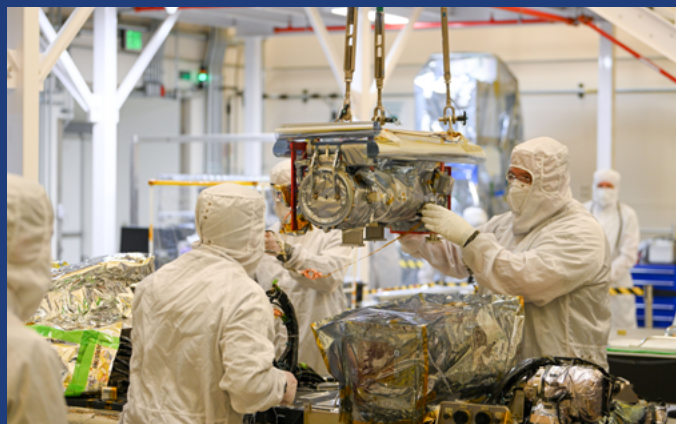
Engineers integrate the nation's first coronagraph on the NOAA GOES-U satellite.

As space commerce rapidly grows, with higher numbers of more sophisticated satellites going into orbit, so does the need for new observations and data to continually improve space weather forecasts. In 2022, 38 SpaceX Starlink satellites burned up after launch as a result of a period of prolonged, yet minor geomagnetic storm conditions. Smaller storms once unnoticed are now causing problems as we become more reliant on advanced technology and increase our activities in space, where that technology is more vulnerable to space weather.