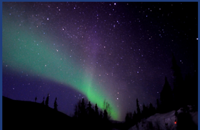
The Aurora Borealis is a visible manifestation of space weather. Chena Springs, Alaska.

How important are NOAA's space weather forecasts? Knowing of an incoming solar storm helps commercial