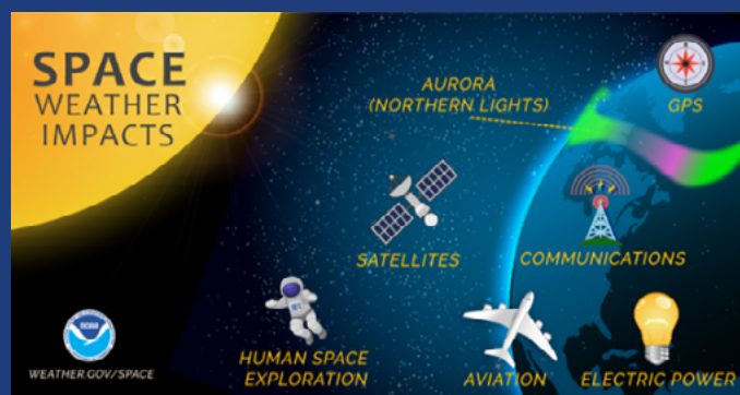
Space weather impacts aviation, auroras, electric power, emergency management, Global Positioning System (GPS), radio communications, satellites, and human space exploration.

efits across sectors including civil aviation, agriculture, satellite industry, communications, and navigation.