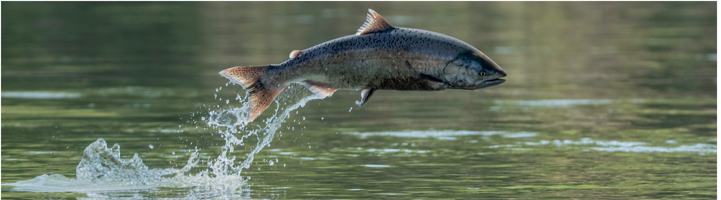
Chinook salmon in California