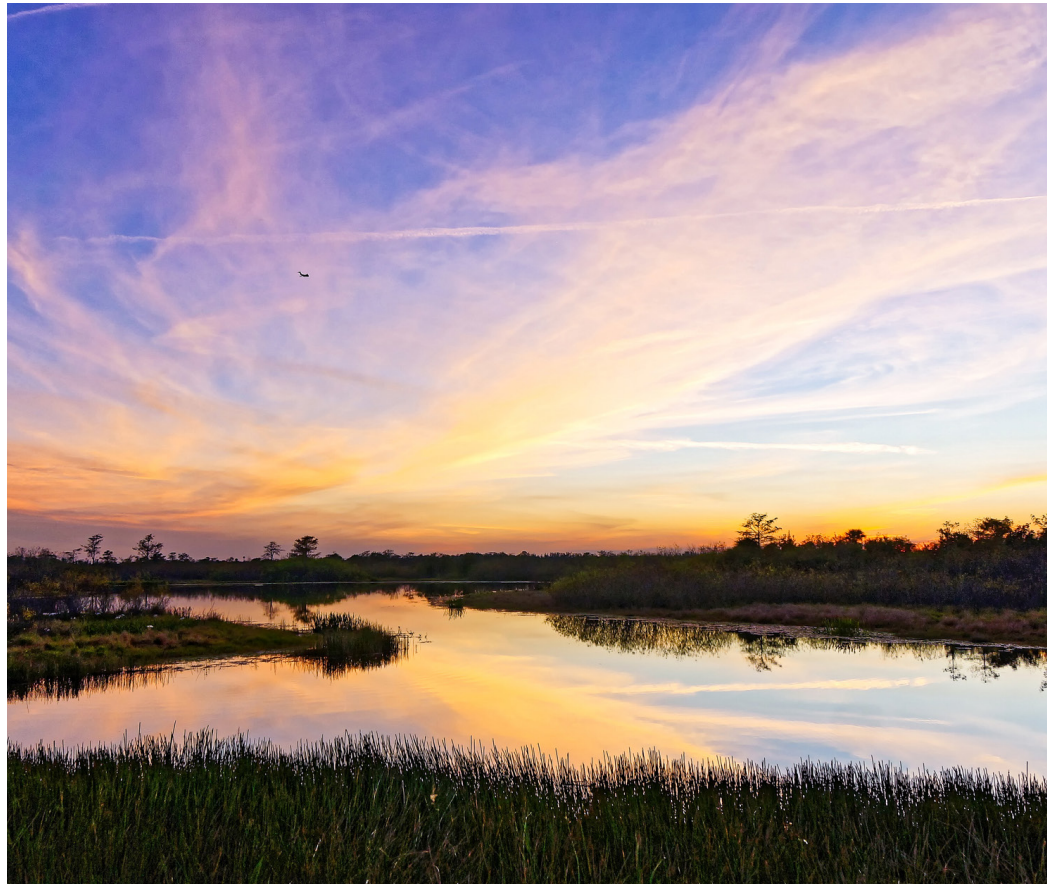
Coastal marsh, Louisiana

1133 15th Street, NW Suite 1000 Washington, D.C., 20005 202-857-0166