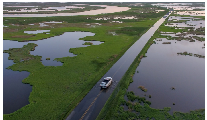
Maple Dam Road at Blackwater National Wildlife Refuge

Grantee: Chickahominy Indian Tribe Grant Amount:.....$350,100 Matching Funds:.....$40,600 Total Project Amount:.....$390,700 Engage the Chickahominy Tribal Community through GIS training, water quality and shoreline risk assessments to identify areas along the James and Chickahominy rivers most impacted by sea-level rise. Project will facilitate development of a strategic plan to address coastal resilience adaptation goals and monitoring systems based on impacts identified.