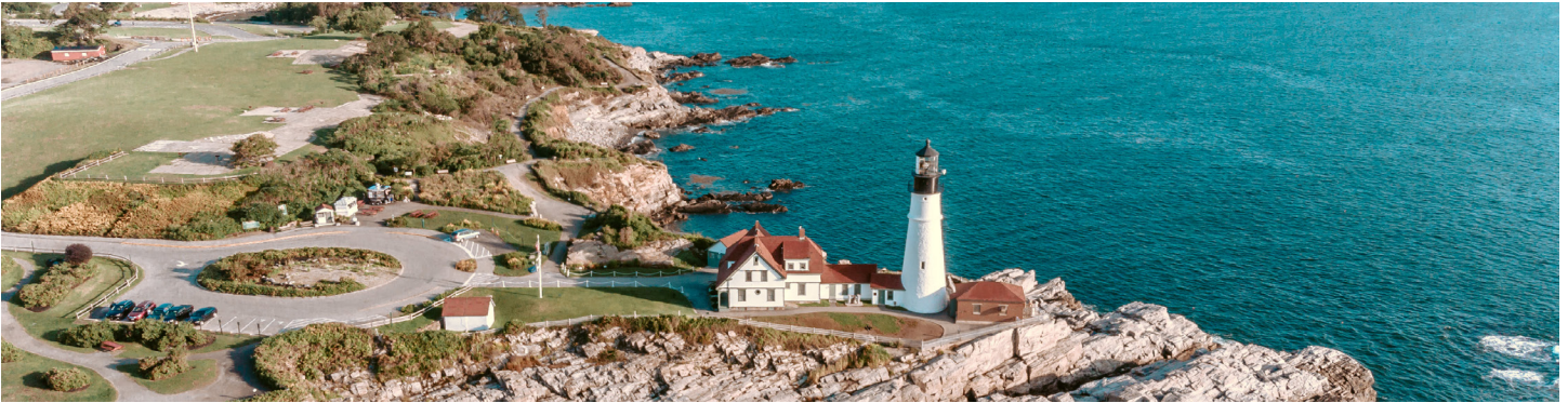
Portland head lighthouse in Maine