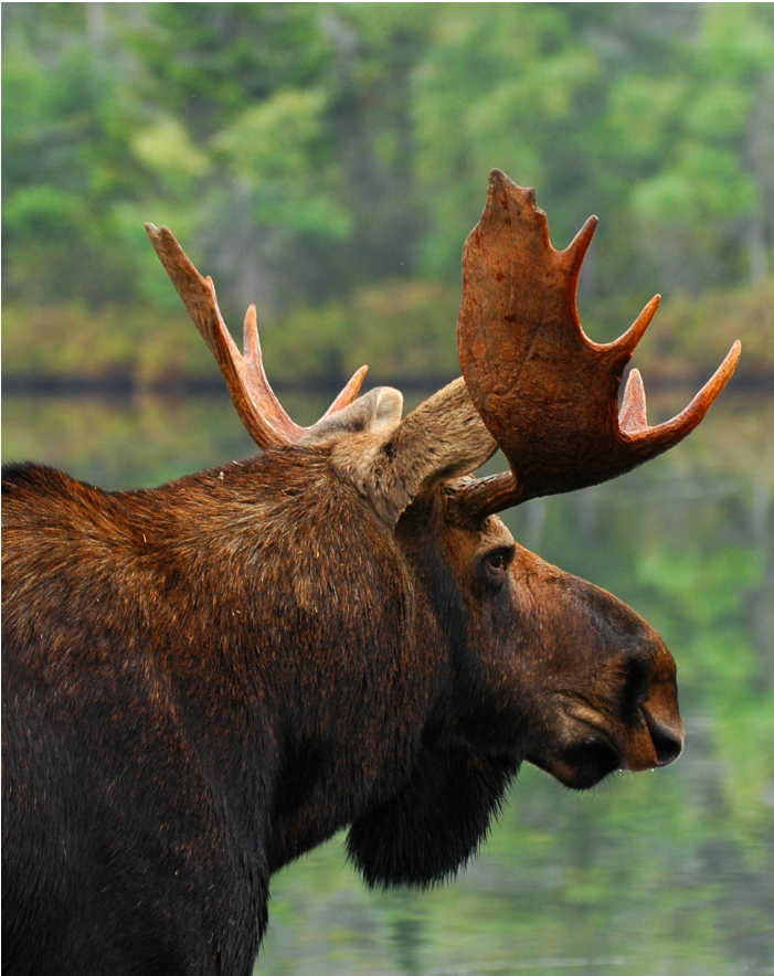
Bull moose in Maine