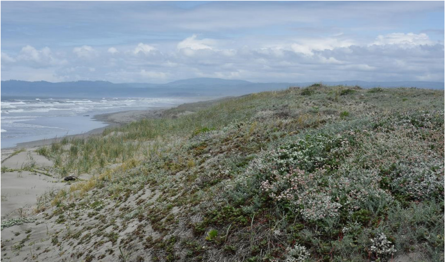
Reforested foredune