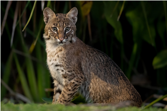
Bobcat in Everglades National Park