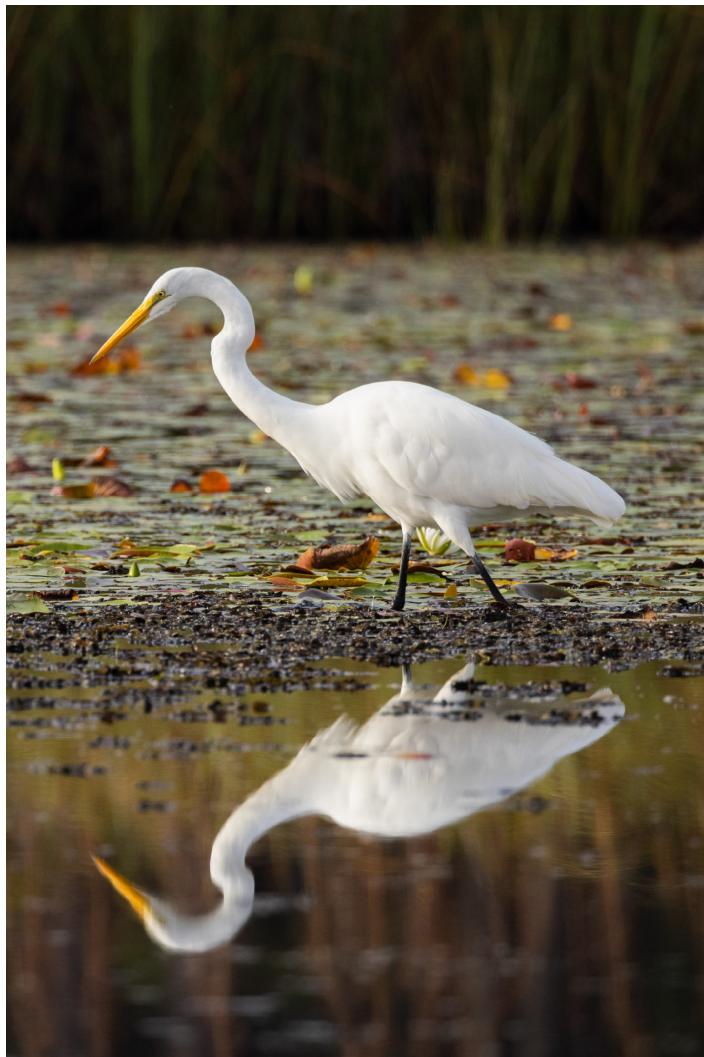
Great egret in Louisiana

Grantee: Chicago Park District Grant Amount:..... $500,000 Total Project Amount:..... $500,000 Develop a plan that identifies ecosystem restoration strategies to improve resiliency of Chicago’s Lake Michigan shoreline. Project will engage with public stakeholders to identify priority projects that enhance aquatic ecosystems and build upon coastal resiliency initiatives to protect shoreline infrastructure.