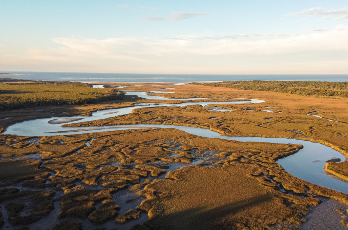
Florida coastal marsh