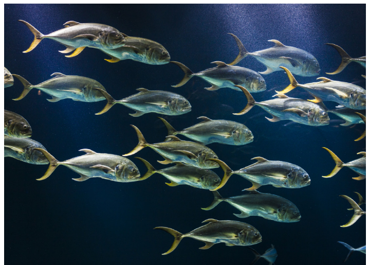
School of crevalle jack

Grantee: Manomet Grant Amount:.....$172,500 Matching Funds:.....$181,800 Total Project Amount:.....$354,300 Increase planning and capacity at the state level for beneficial use of dredged material to improve ecosystem health and reduce flood risk impacts. Project will identify successful projects to emulate, and convene partners to identify habitat areas that can beneficially use dredged materials to increase coastal resiliency.