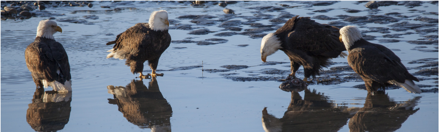
Bald eagles in the Chilkat Bald Eagle Preserve