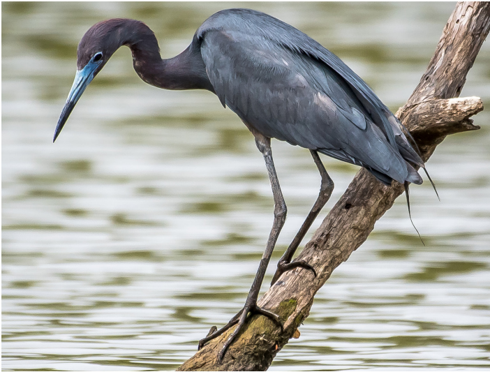
Little blue heron