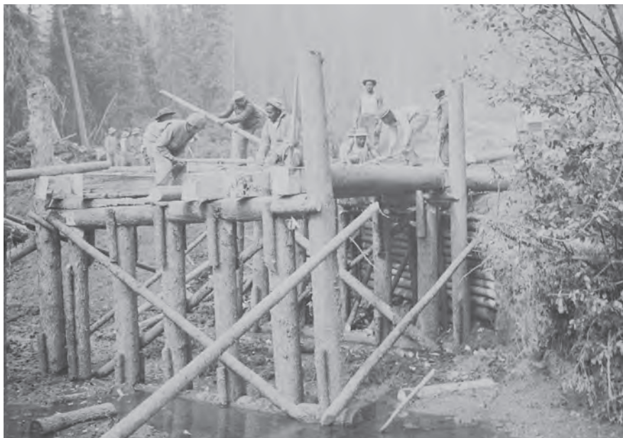
Soldiers of the African American Ninety-Fifth General Services Regiment at the Sikanni Chief River Bridge, British Columbia, 1942.