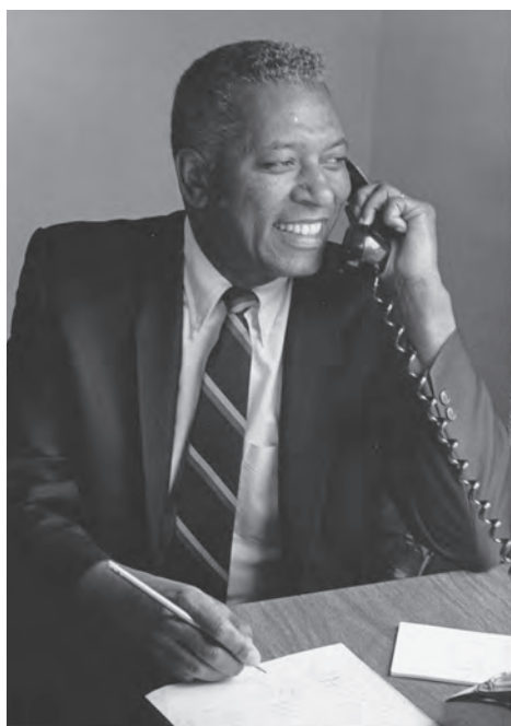
Willard L. Bowman, c. 1971. Bowman became the first black to be elected to the Alaska State Legislature when he became a representative from South Anchorage in 1970.

Bowman’s research on Southcentral Alaska led him to advocate for the creation of a subcommittee of the Citizens Council for Community Improvement (CCCI), a research group to act under the authority of Governor Egan’s Human Rights Commission. Bowman led the CCCI and developed a comprehensive survey on discrimination in Alaska, with an emphasis on the Southcentral region. The CCCI reported high levels of housing segregation and concluded that white residents deliberately excluded minorities from the housing market and relegated them to the least desirable land. To gather information, the CCCI sent out questionnaires to real estate brokers and salesmen. They asked agents and brokers “If they sold to minorities [or] if they would sell or rent to minorities in various designated districts such as Fairview, Mountain View, Spenard, Etc.” Bowman received a low response rate; of the several dozen real estate brokers contacted, twenty returned the questionnaire. Despite the small sample size only two stated, they “would sell or rent to [prospective minority home buyers or renters] anywhere.”