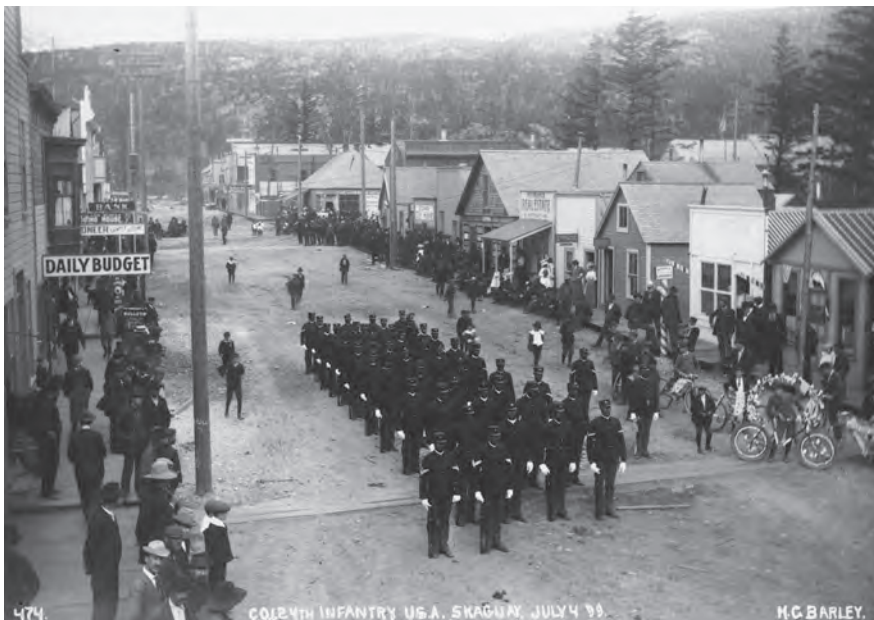
Company L, Twenty-Fourth Infantry, Skagway, July 4, 1899.