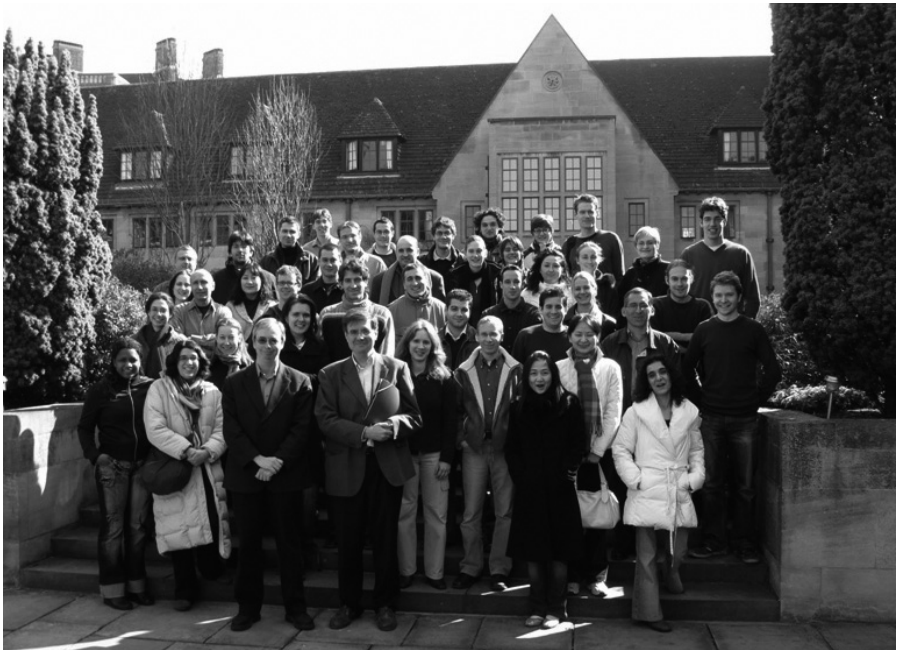
Royal Economic Society Easter School in Econometrics, 2006