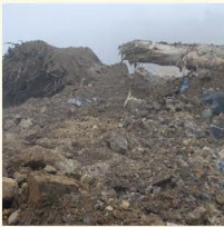
Minimize compaction of growth medium.