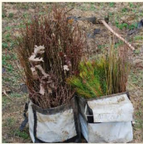
Plant native trees and shrubs.