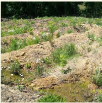
Plant tree compatible ground plants.