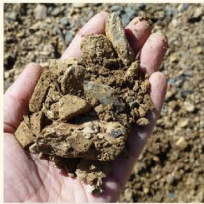
Create suitable reforestation growth medium.