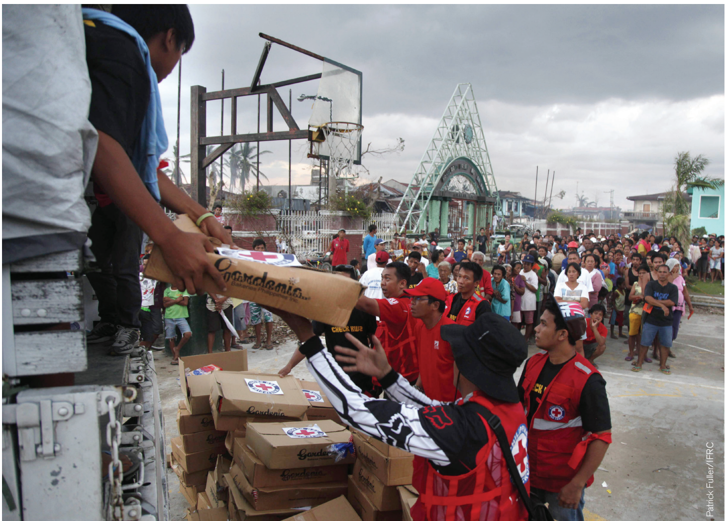
The Philippine Red Cross was one of the first organizations to distribute food relief to residents in the hard-hit town of Dagami, Leyte.

Teams from Red Cross and Red Crescent partners around the world rushed to the Philippines to help, and pitched in with a wide range of support, including crucial relief supplies, health care services, assistance with rehabilitation of clinics and hospitals, communications equipment, clean water and sanitation. The American Red Cross stepped forward with financial support, relief supplies, experienced disaster specialists and help with family tracing services that can reunite families with missing loved ones. Across the Philippines, local and international volunteers contributed from their diverse pools of expertise, united by the shared Red Cross mission to prevent and alleviate suffering.