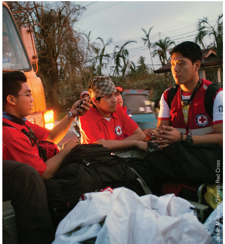
Red Cross volunteers deliver emergency water and food to a local hospital in the Philippines.