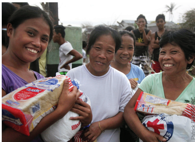
Thanks to our supporters, the Red Cross was able to provide critical food relief to typhoon survivors across the Philippines.

The American Red Cross responds to disasters around the world by mobilizing financial support, providing pre-positioned relief supplies, deploying disaster response experts and, in some cases, implementing recovery and preparedness programs. The remarkable generosity of our supporters—individuals, corporations and foundations—drives our ability to provide relief and assist our partners in the global Red Cross network. We are grateful for your trust.