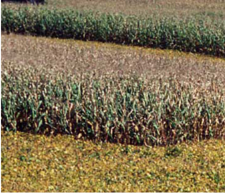
Stripcropping with Cover Crops, Lancaster County, PA.