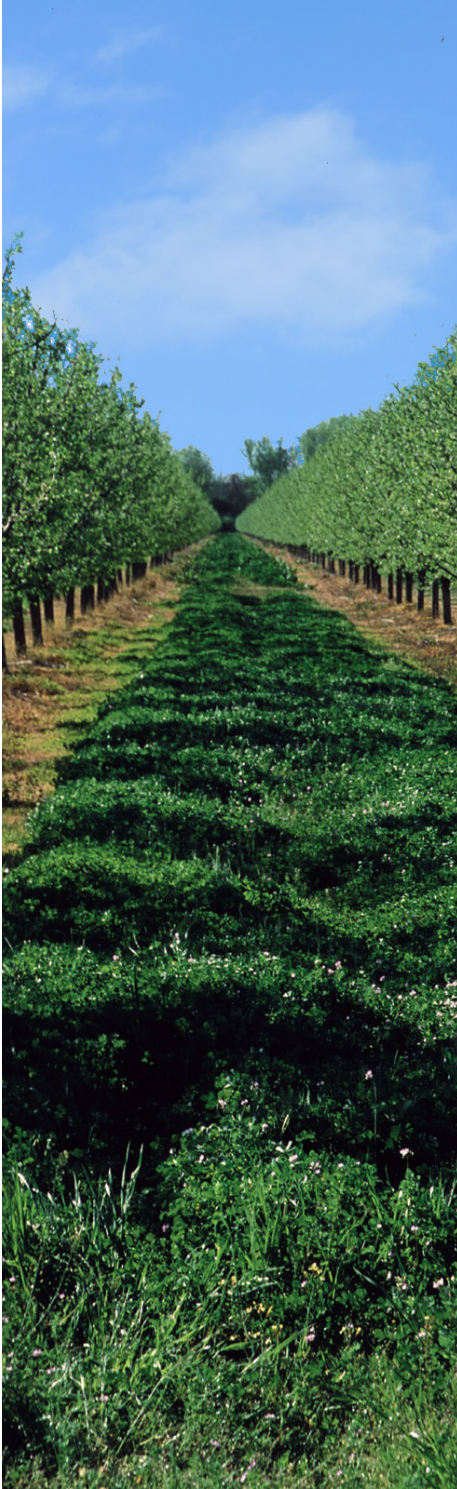
Cover crops in an orchard reduce soil erosion.