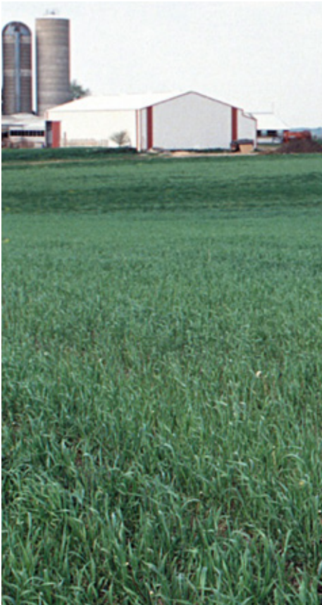
Cover crops on a field in Black Hawk County, Iowa.