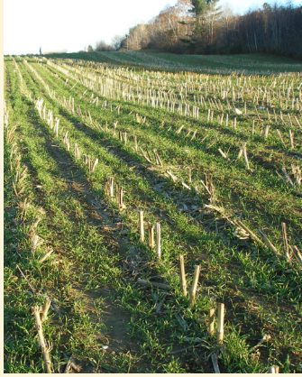
A cover crop grows in no-till corn residue on a Maine farm.