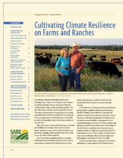
Cultivating Climate Resilience on Farms and Ranches www.SARE.org/climate-resilience