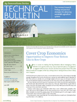
Cover Crop Economics www.SARE.org/cover-crop-economics