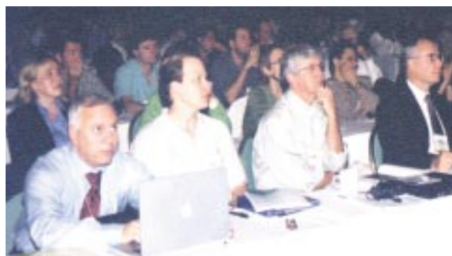
Workshop participants at 2001 annual meeting in San Diego.

Submit your proposals to CynthiaL.Phelps@uth.tmc.edu . Submission details at www.sfn.org/workshops . Questions? Cynthia Phelps (713) 500-3926.