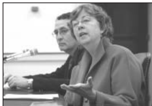
SfN President Anne Young and Parkinson's advocate Perry Cohen testify before House appropriations subcommittee (see page 6).

The House Budget Committee adopted a budget that calls for non-defense program spending at a level slightly less than President Bush requested. Although the Senate provided a $1.3 billion increase that could go to the National Institutes of Health (NIH), it is unlikely to survive a House-Senate conference committee on the budget. These spending restrictions will not make an appreciable dent in projected deficits, but they are certain to force some difficult choices when Congress considers the details later this year.