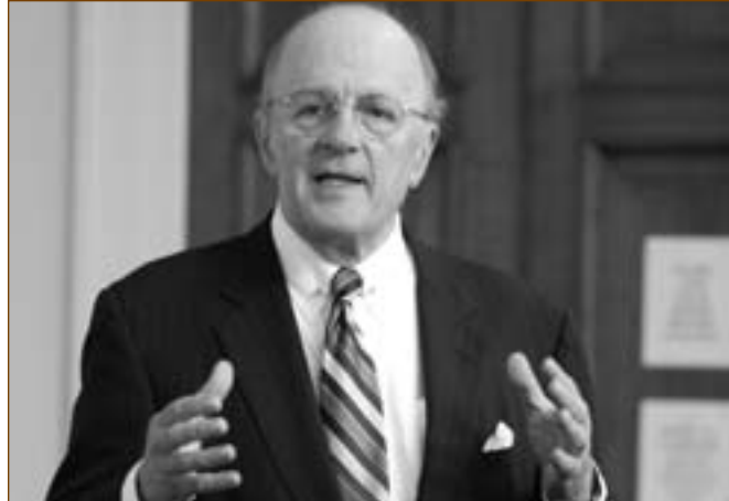
Sherwood Boehlert speaks to SfN members on Capitol Hill.