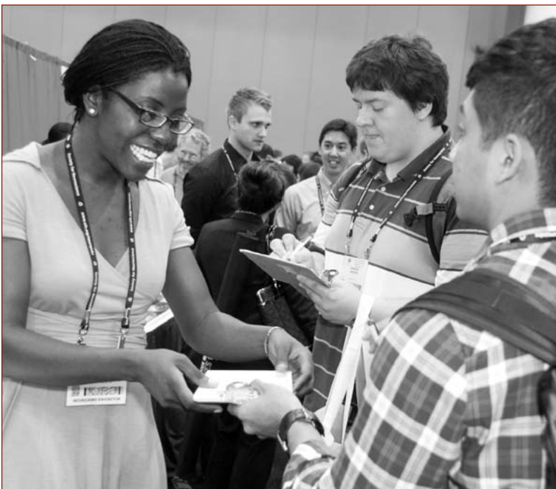
The new and very popular Graduate School Fair allowed Neuroscience 2012 attendees to connect face-to-face with 35 graduate programs.

Undergraduates and neuroscientists alike flocked to the Society's first-ever Graduate School Fair to meet with 35 different neuroscience graduate programs. The well-attended fair was a great success. Prospective students and graduate schools used the opportunity to meet face-to-face to discuss program offerings for budding neuroscientists. To learn more about SfN's online Neuroscience Training Program Directory and Institutional Program membership or to participate in the Neuroscience 2013 Graduate School Fair, contact ndp@sfn.org . ■