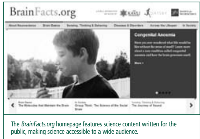
The BrainFacts.org homepage features science content written for the public, making science accessible to a wide audience.

Other AAAS panels examined the risks and rewards when scientists share their findings and research frustrations with the general public.