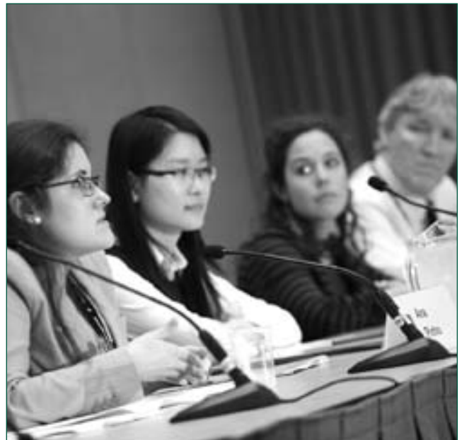
Press conference presenters at Neuroscience 2013 described recent findings revealing differences in the brains and behaviors of trained musicians.

When musicians and nonmusicians were exposed to only a single sound, both groups accurately reported they felt a single vibration on the finger. However, when a single vibration was accompanied by two or more tones, the nonmusicians described feeling multiple vibrations. Despite hearing multiple tones, the musicians continued to accurately report feeling only a single vibration.