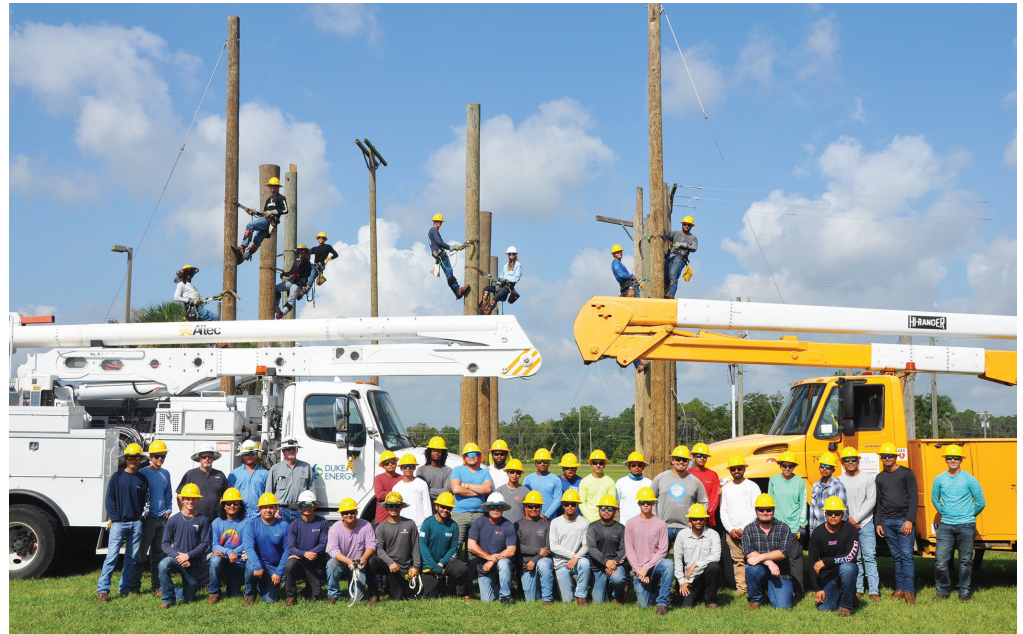
SFSC's Electrical Line Worker Program prepares students to build, maintain, and repair overhead and underground electrical systems.

SFSC's Electrical Lineworker Program prepares students to work as electric line technicians in the construction, maintenance, and repair of electric utility systems. Through 1,500 contact hours of training at the SFSC Hardee Campus, students gain an understanding of electrical systems, operations, and safety while mastering competencies in electrical distribution, basic electrical theory, and underground electrical construction operations. They learn how to maintain electric power systems and use electrical distribution equipment. The program provides practice in climbing, framing, building single and three-phase overhead lines, pole top and bucket rescue techniques, operating bucket trucks, and