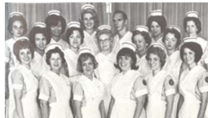
Morris Harvey's First Graduating Nursing Class