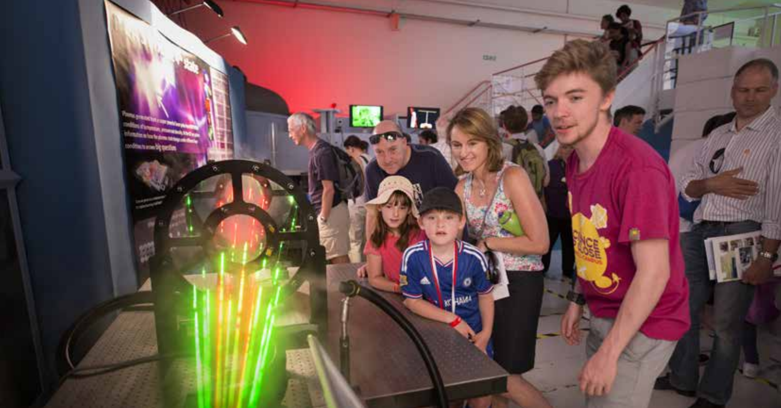
Members of the public taking part in one of STFC's open day events