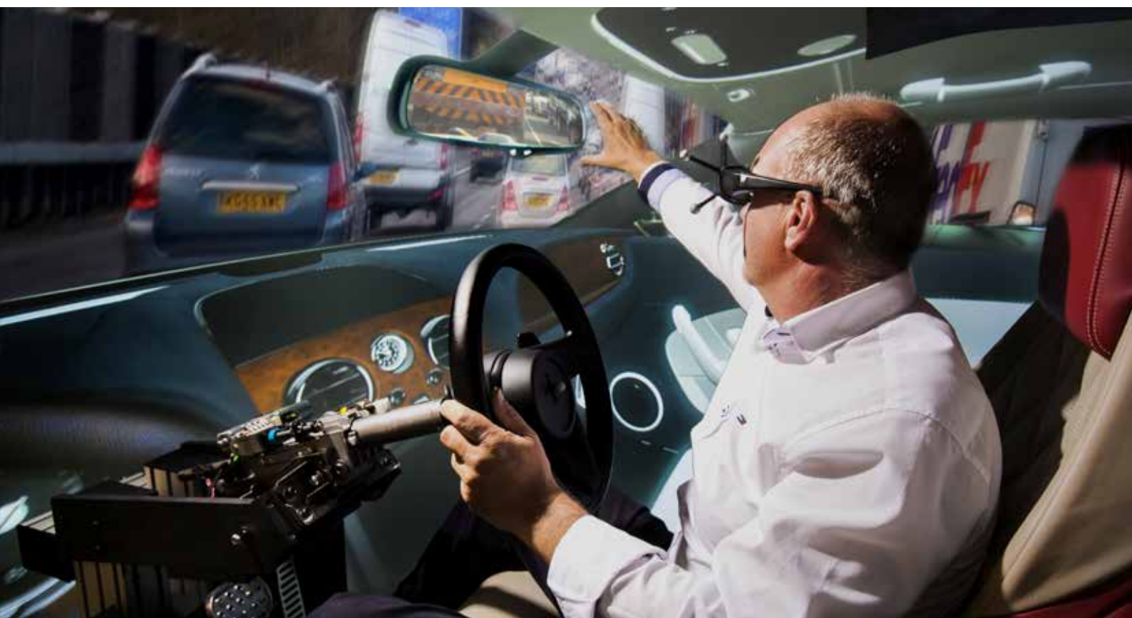
The Hartree Centre's visualisation suite

To ensure that all aspects of our work support the overall Campus vision and that the synergies are fully realised, we will focus our activities on seeding and developing clusters of economic activity at each Campus around specific sectors or areas of excellence; emulating and replicating the success of the space cluster at Harwell – widely recognised as the national lead for economic growth through the exploitation of space technologies. A specific aspiration is to build a cluster of data-intensive enterprises around STFC's Hartree Centre at Daresbury. Government confirmed the continuation of the funding required to deliver Hartree Phase III in our spending review settlement, which in partnership with IBM will provide a major expansion and development of the existing Centre. By integrating a combination of cutting-edge technology,