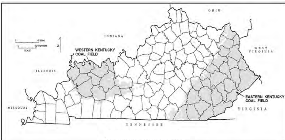
Figure 1. Kentucky coal fields.

The Western Kentucky Coal Field had original in-place resources (coal in the ground greater than 14 inches thick) of 41 billion tons, and the Eastern Kentucky Coal Field had original in-place resources of 64 billion tons, for a total resource of 105 billion tons for the entire state. Tables 2 and 3 show remaining resources greater than 28 inches thick for the principal coal beds in Kentucky—the resource with the highest potential for future development.