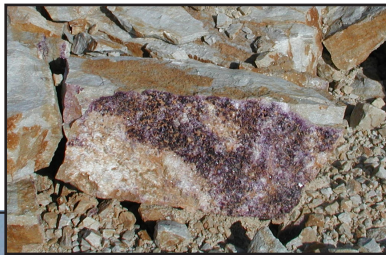
Active fluor spar mine in Livingston County and a sample of the fluor spar from the operation.

Freshwater pearls—considered precious stones--and polished Kentucky agate—considered semiprecious stone--are popular collecting items in the state. Kentucky agate was designated as the official state rock by an act of the General Assembly in 2000 and is highly regarded by mineral collectors. The freshwater pearl is the official state gemstone.