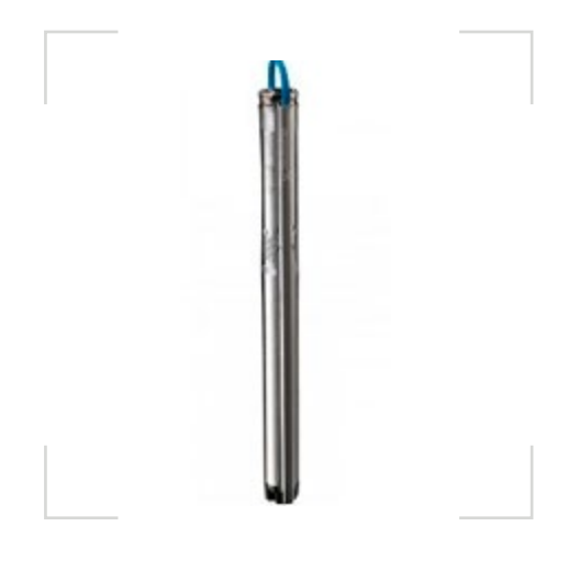
TERMS OF SALE Cash & carry, Flexible installments