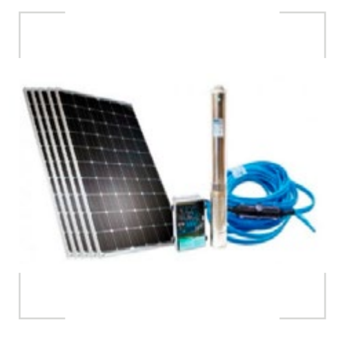
TERMS OF SALE Cash & carry, Flexible installments