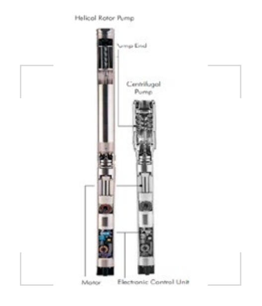
TERMS OF SALE Cash & carry, Flexible installments