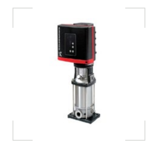
TERMS OF SALE Cash & carry, Flexible installments