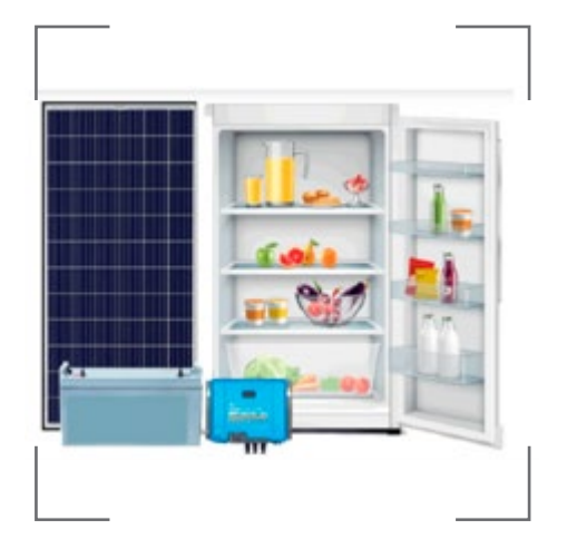
TERMS OF SALE Cash & carry, Flexible installments