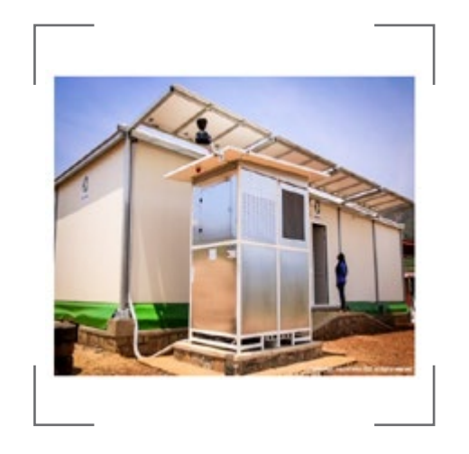
TERMS OF SALE Cash & carry Flexible installments