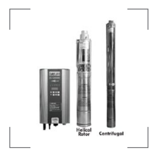
TERMS OF SALE Cash & carry