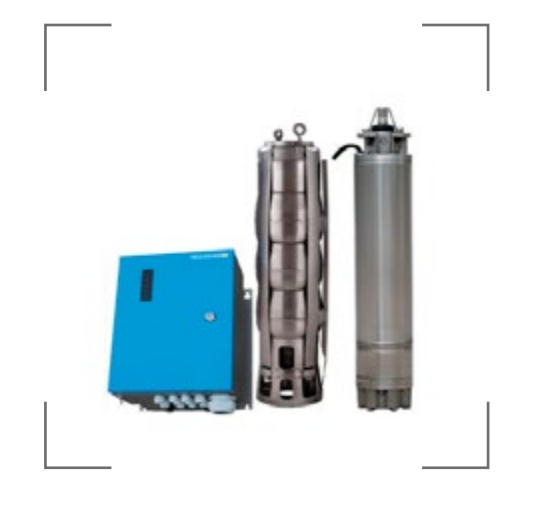
TERMS OF SALE Cash & carry