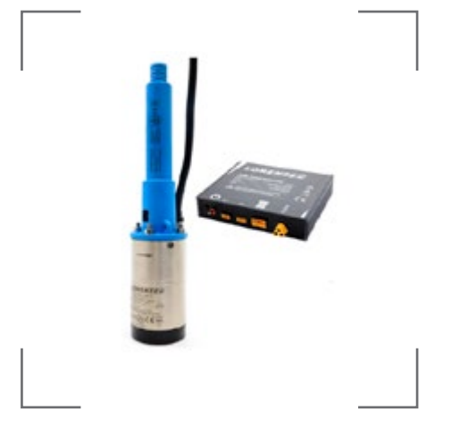
TERMS OF SALE Cash & carry