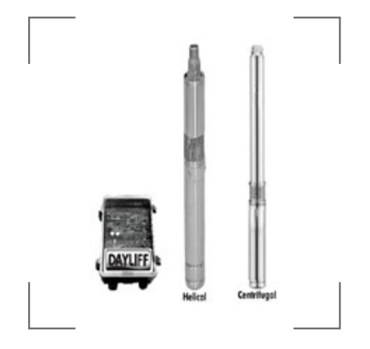
TERMS OF SALE Cash & carry