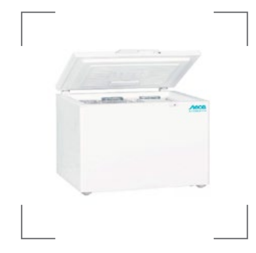
TERMS OF SALE Cash & carry