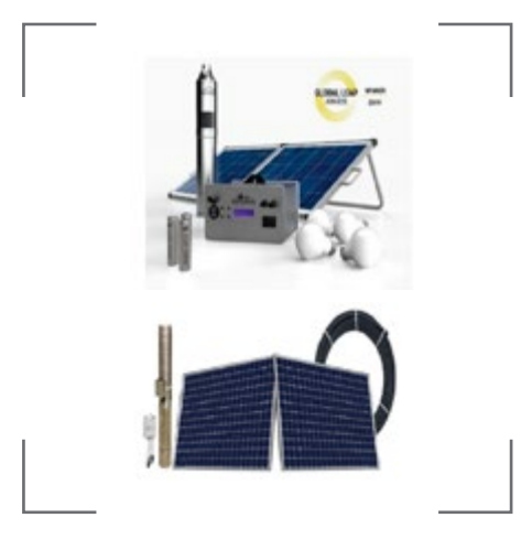
TERMS OF SALE Cash & carry