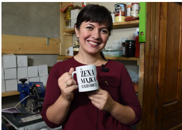
Entrepreneurs lead the way. USAID partners with small and medium-sized businesses to increase their viability, while working with government bodies to improve the enabling environment for economic growth.