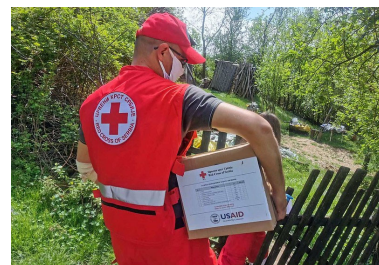
Emergency assistance: USAID has partnered with Serbia on a wide range of disaster relief activities. In 2020, as part of our COVID-19 assistance we worked with the Serbian Red Cross to provide hygiene packages for Serbia's most vulnerable families.