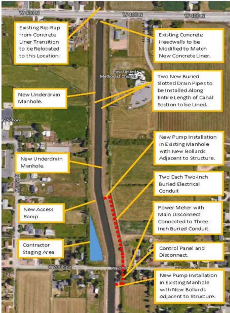
Figure 2.1 Site Plan (Typical)

The proposed action area evaluated in his EA begins at 200 South in Marriott-Slaterville, the end of the previously authorized Phase 3 lining project and terminates at the Arthur V. Watkins Reservoir (Figure 2.1 Site Plan).