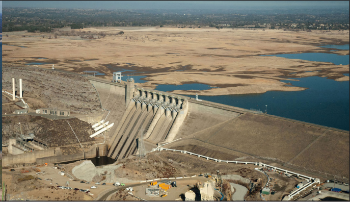
Folsom Lake - January 16, 2014

Anomalously wet events are another type of disruption to the hydrological cycle. 2019 was one of the wettest years on record for the majority of the Missouri River Basin. Excessive rainfall led to massive delays in crop planting, with nearly 20 million acres of land being left unplanted.