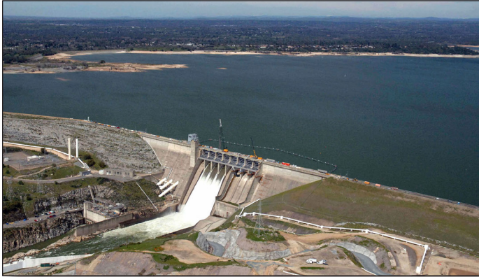
Folsom Lake - July 20, 2011

Defined as a deficiency in precipitation, drought impacts the same sectors of society that rely on the hydrological cycle, including agriculture, health, and our supplies of energy and drinking water. Drought can occur in all climate zones and last from months to years. For example, the 2011-2017 California drought caused billions of dollars in damage, largely due to agricultural losses and efforts employed to combat the event. Because of the interplay between physical changes, such as lake levels and soil moisture, and human factors, such as transportation and impacts to our food supply chain, droughts are complex events that can have widespread impacts.