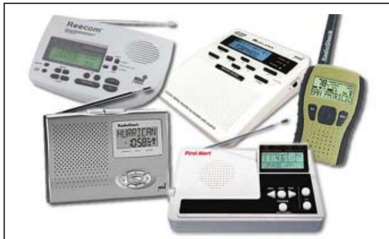
Selection of NOAA Weather Radio receivers available at electronic retailers.

Receivers carrying the Public Alert logo meet certain performance criteria including, SAME, alert customization and a battery backup. Select units also allow connections for an external antenna and devices for the hearing or visually impaired, such as strobe lights, pagers or bed shakers.