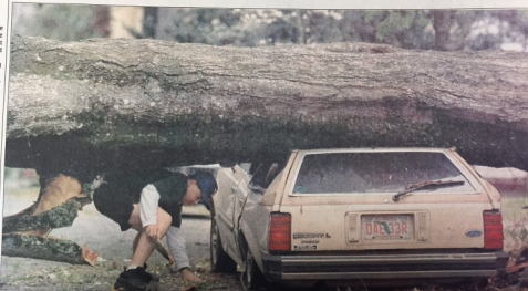
BEN SHARP, 14, collects pieces of bark for a souvenir from the oak tree that fell on his neighbor's car Saturday in Gainesville. The damage was caused by a massive storm that swept through the Panhandle and Florida on the East Coast of the state Saturday in Gainesville. The storm killed at least 12 people, 10 from...