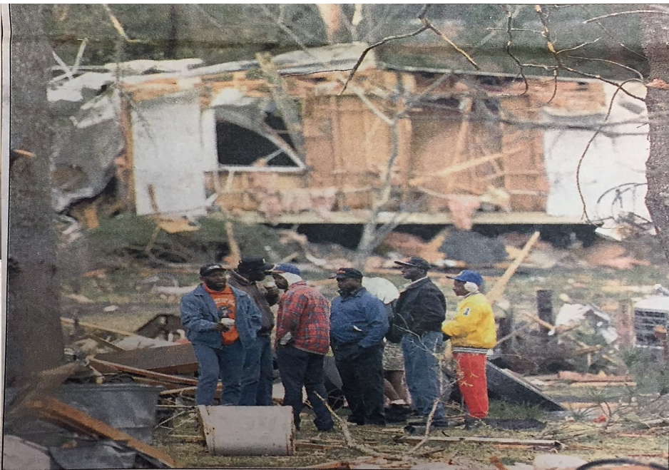
CHIEFLAND RESIDENTS stand among the ruins of their neighborhood Saturday after a tornado swept through late Friday night, killing three and wounding several others.