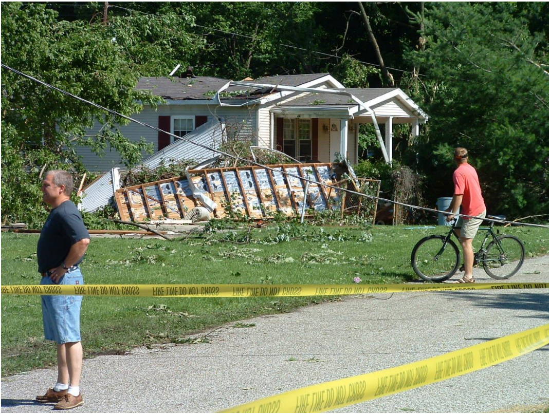
More from Newburgh: