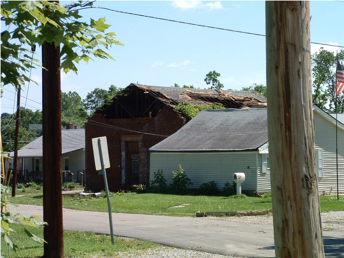
BELOW ARE PHOTOS COURTESY OF SHAWN WEBER OF TORNADO DAMAGE IN NEWBURGH.