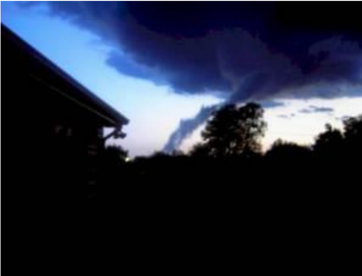
PHOTO OF TORNADO TAKEN ABOUT 4 MILES EAST OF HANSON, KY NEAR MADISONVILLE.

In addition to the tornadoes on May 30, widespread straight-line winds around 60 MPH buffeted large parts of southeast Missouri, western Kentucky, southern Illinois, and southwest Indiana. There were reports of large hail, especially across southeast Missouri. Following is a list of all the reports: