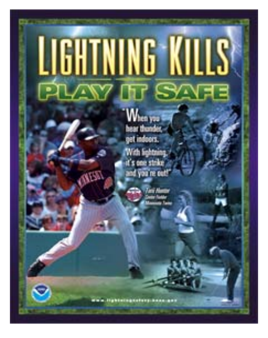
Major League Baseball Minnesota Twins Star Headlines Lightning Safety

This year the NWS LSAW Team has also teamed up with Little League Baseball to promote lightning safety. A NOAA Press Release describing these efforts was issued on March 17 entitled "Keeping the Game Safe – NOAA Teams with Little League Baseball on Lightning Safety Awareness."