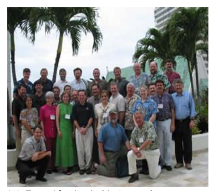
2004 Tsunami Coordination Meeting attendees.

The emphasis was on getting all the key people in the tsunami warning program together. In NWS, this meant everyone from field WCMs to national headquarters. It also meant bringing in key people outside NWS: emergency management officials, primarily state-level, and other government organizations with interest in the program such as FEMA, the U.S. Geological Survey and the NOAA Ocean Service.