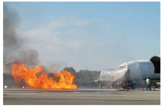
A simulated plane crash exercise included real flames.

VanCleve took part as an event observer, assigned to evaluate the