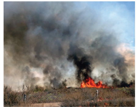
Wildfire burns dry vegetation in southern California

The program stemmed from a fire weather workshop last spring in which communication between the two agencies was named as an area for improvement. During the prescribed burn season, forecasters will attend exercises and during the