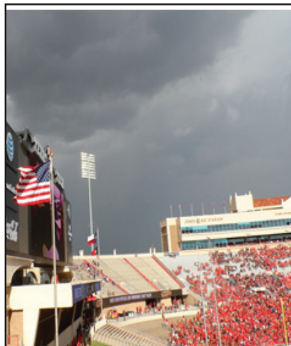
Thunderstorms threaten the Texas Tech stadium, Sep. 7, 2013.

Keeping thousands of college students, alumni and visitors safe in an outdoor venue is a challenge Texas Tech University (TTU) decided to take on. In conjunction with NWS Lubbock, TTU, a StormReady University since 2007, made lightning safety awareness a top campus priority throughout the summer and had a new plan ready for its fall sports activities.