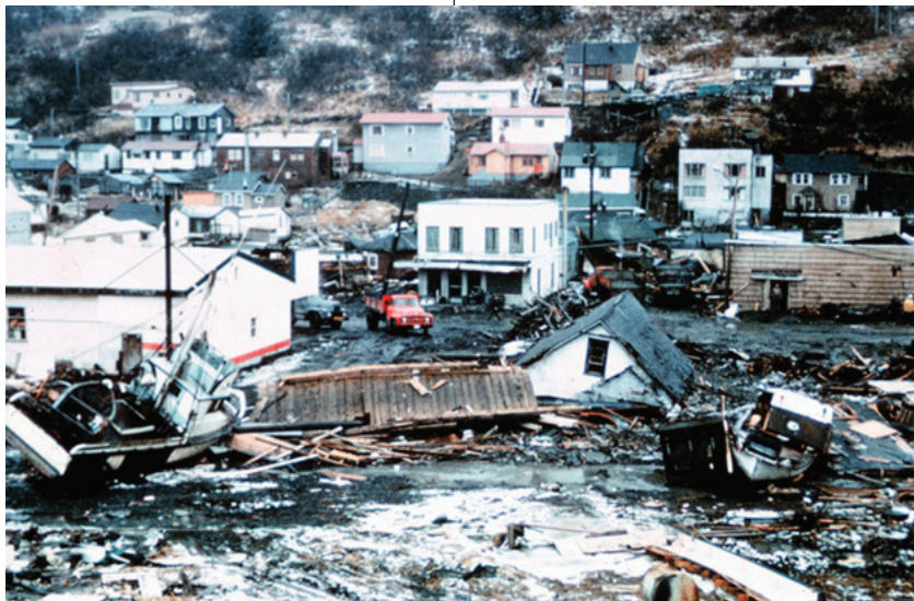
Tsunami damage at Kodiak, AK, after the 1964 Great Alaska Earthquake and Tsunamis.