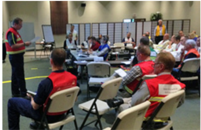
The Operations Section Chief briefs the Unified Command on the oil spill during the planning meeting.

Over 100 other local, private and state partners took part including California Fish and Wildlife.