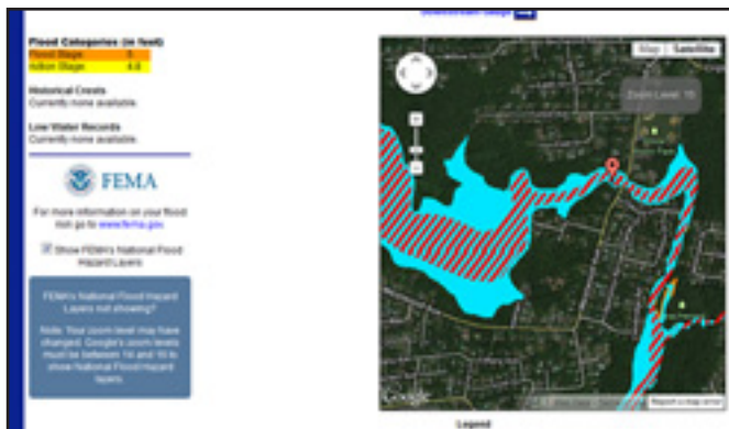
FEMA's Regulatory Floodway and Flood maps for the Pasack River near the Beachwood Park area of Westwood, NJ