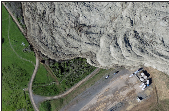
The toe of the landslide impinged on farmland and gas wells.

NWS Grand Junction supported the rescue effort by providing special spot forecasts for the landslide area at least twice daily through the first 11 days after the event occurred. NWS Service Hydrologist Aldis Strautins also provided technical assistance to EMs and other government officials at the site of the landslide.