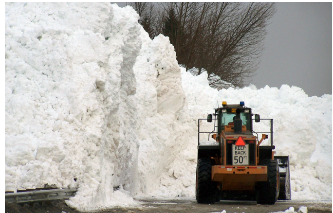
Clearing snow from the Seward Highway after an avalanche.

Alaska Department of Transportation (DOT) staff plan to use artillery to clear snow prone to avalanches. The lead time before a snowstorm in mid-January helped the Alaska DOT plan artillery work at five locations along the Seward Highway, giving staff ample time to notify the public through roadside electronic message boards and the state's online Alaska 511 system.