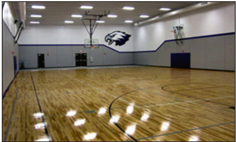
Gymnasium that is also a tornado safe room at the high school in Fair Grove, MO.

Since 2004 in Missouri, 58 safe rooms in schools or community centers have been built; an additional 86 are in the planning stages.