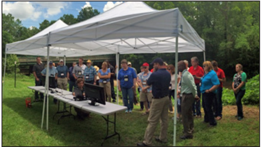
Anthony Gotvald, USGS, describes the USGS gaging equipment and its value in observing and monitoring streamflows on Peachtree Creek.

NWS looks forward to working with other federal agencies and non-government organizations, such as ASFPM, to raise awareness of flood risk in our communities.