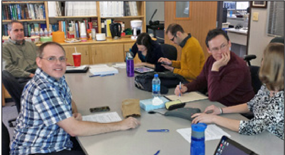
Some 14 NWS staff from five Montana and Idaho forecast offices, NWS Western Region (WR) Regional Operations Center, and the NWS Employee organization met to brainstorm ways to improve Impact Based Decision Support (IDSS) and move towards a more Weather-Ready Nation.