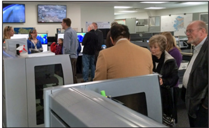
Visitors tour the National Tsunami Warning Center in Palmer, AK, during Tsunami Preparedness Week Open House.

If you are in a tsunami zone and feel intense shaking lasting more than 20 seconds such that standing is difficult, act immediately. Move to at least 100 feet above sea level or a mile inland, and if impossible, try to go up at least three stories in a reinforced concrete building. Once in a safe place, wait for the all clear from local officials.